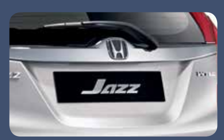
Chrome Rear License Garnish

The tailgate is topped off with a stylish spoiler with an integrated third brake light.