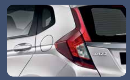
Rear Combi Lights

The door mirrors come with integrated turn lights and automatically retract for your convenience.