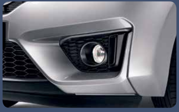
Front Fog Lights

Sleek and thin Halogen Headlights enhance the profile of the Jazz.