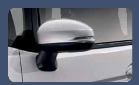
Auto Retractable Door Mirror with Turning Lights

A sporty set of 16-inch multi-spoke Alloy Wheels.