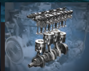
Graphite coated pistons