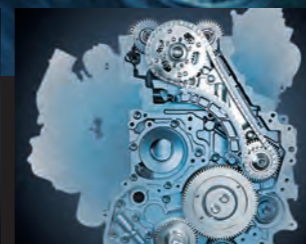
Chain driven camshaft