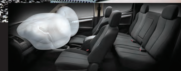
Dual front Airbags