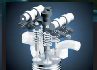
Robust cast roller rocker arm and pivot bearings