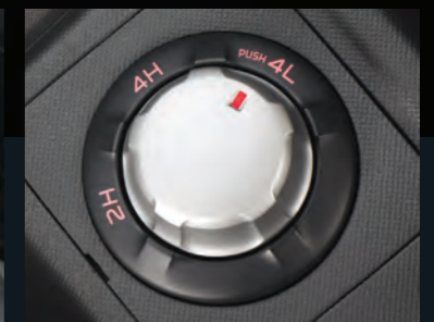
Shift-on-fly 4WD knob