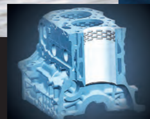
Melt-in liner (Anti-friction induction hardened)

With a long history of leading the development of numerous technologies and innovations in the field of automotive diesel engines, ISUZU is acknowledged as the global diesel engine expert. Our innovative clean diesel technologies, excellent fuel efficiency and low pollution alternate fuel vehicles are currently viewed as having immense potential to help prevent global warming and contribute to environmental preservation.