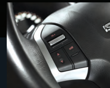
Steering embedded audio controls