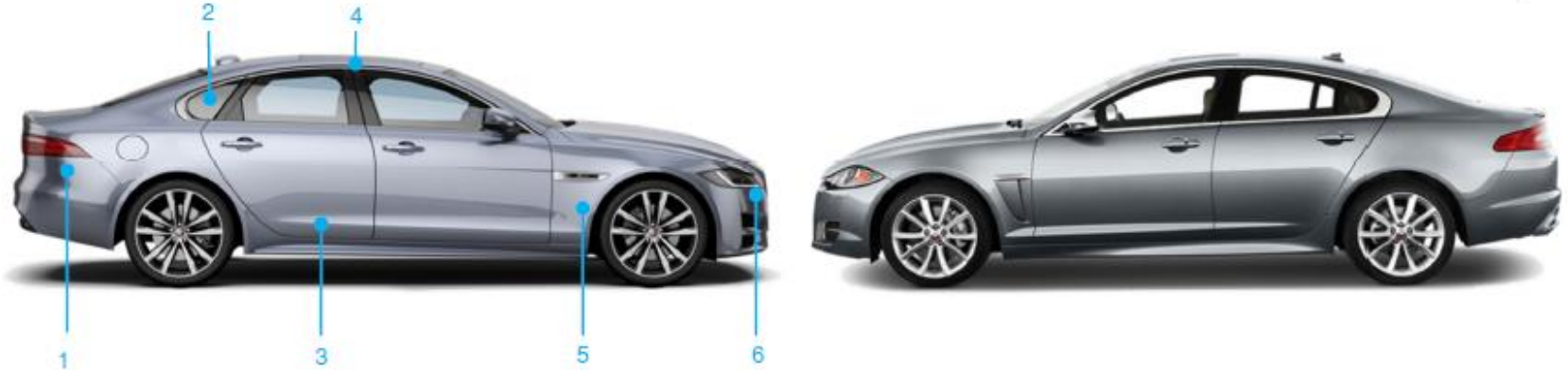
Jaguar XF 15my