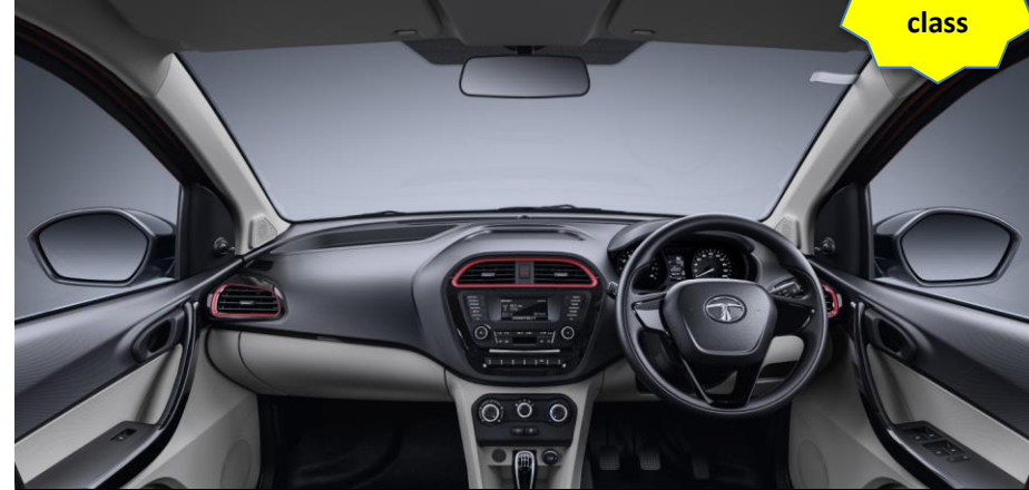
Dual-tone interiors with piano black finish and sporty red accents