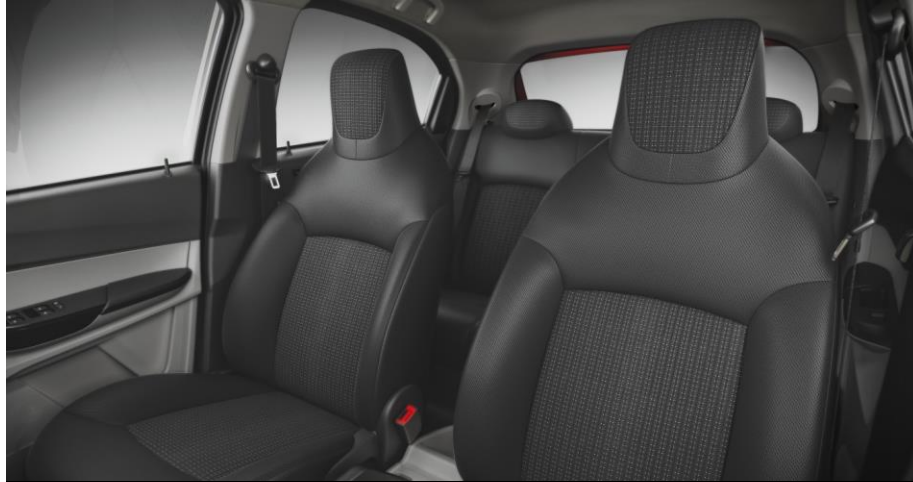
New patterned seat fabric