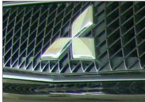
Sporty Diamond Mesh Grill