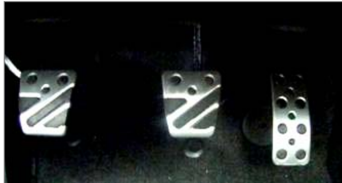
Sporty Alloy Pedals