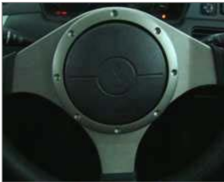
Sporty MOMO Steering Wheel