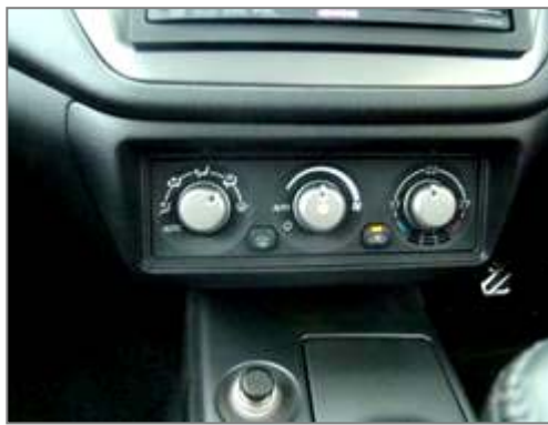
Climate control air conditioner