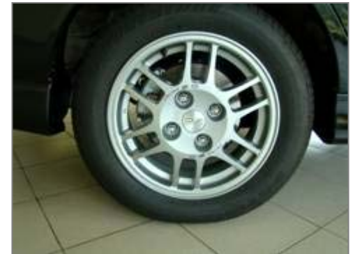
Sporty Oz Alloy Wheels