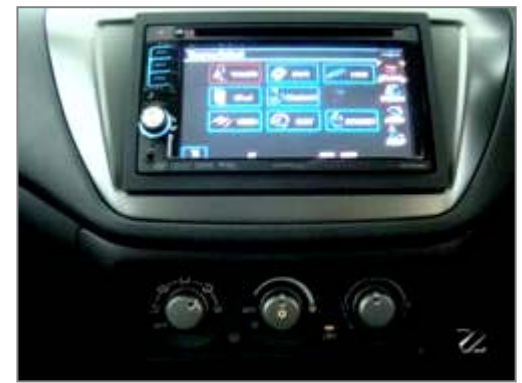
Touch screen Kenwood Music system