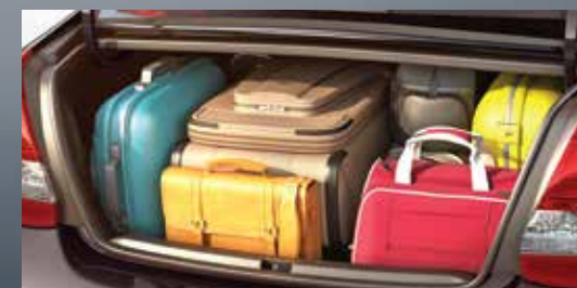
BEST-IN-CLASS 592l # BOOT SPACE