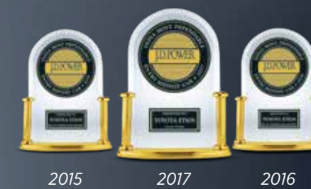
3 YEARS IN A ROW

THE TOYOTA ETIOS RANKED MOST DEPENDABLE ENTRY MID-SIZE CAR IN THE J.D. POWER 2017 INDIA VEHICLE DEPENDABILITY STUDY † .