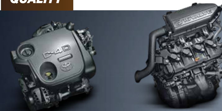
POWERFUL 1.4L DIESEL ENGINE