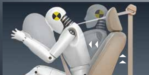
FRONT SEAT BELT WITH PRE-TENSIONER & FORCE LIMITER