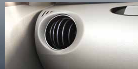
BEST-IN-CLASS AC WITH MULTIDIRECTIONAL VENTS