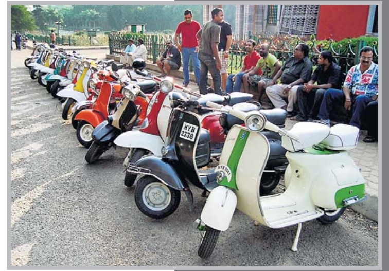
HUES HUE: Geared scooters manufactured before 1985 were welcome at the rally