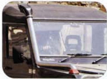
Stainless Steel Air Intake Snorkel