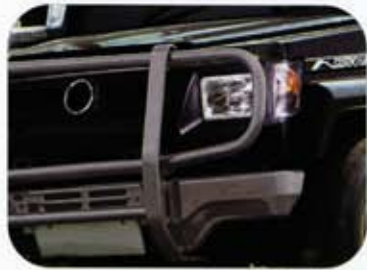
Silver Grey Powder Coated Bumpers & Cow Guard