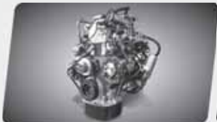
Unbeatable Power & Torque

New Engine - BS-IV, FM 2.6 CR Flat 230 Nm Torque