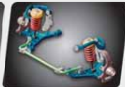
Best In Class Ride Quality

Front: New Independent Coil Spring on Struts