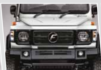
New Facia, Front & Rear Steel Bumper - Macho Looks