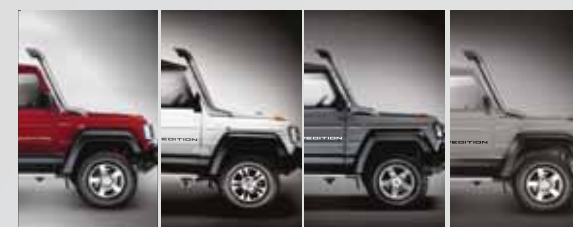
Copper Red Superior White Matt Black Moondust Silver