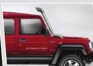
Snorkel Intake - Breathes High Altitude Fresh Air