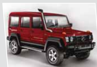
Hard Top with AC - Comfort Redefined