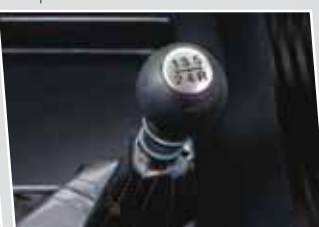
New Gear Box, Cable Shift - Effortless Gear Shifting