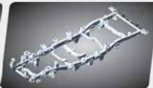
Most Rugged & Reliable

New Engine - BS-IV, FM 2.6 CR Flat 230 Nm Torque