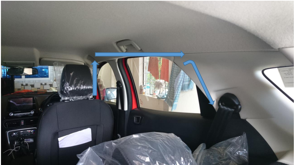
13. Do the wiring for the AV cable from the dashboard to the tail gate using the side door beading.