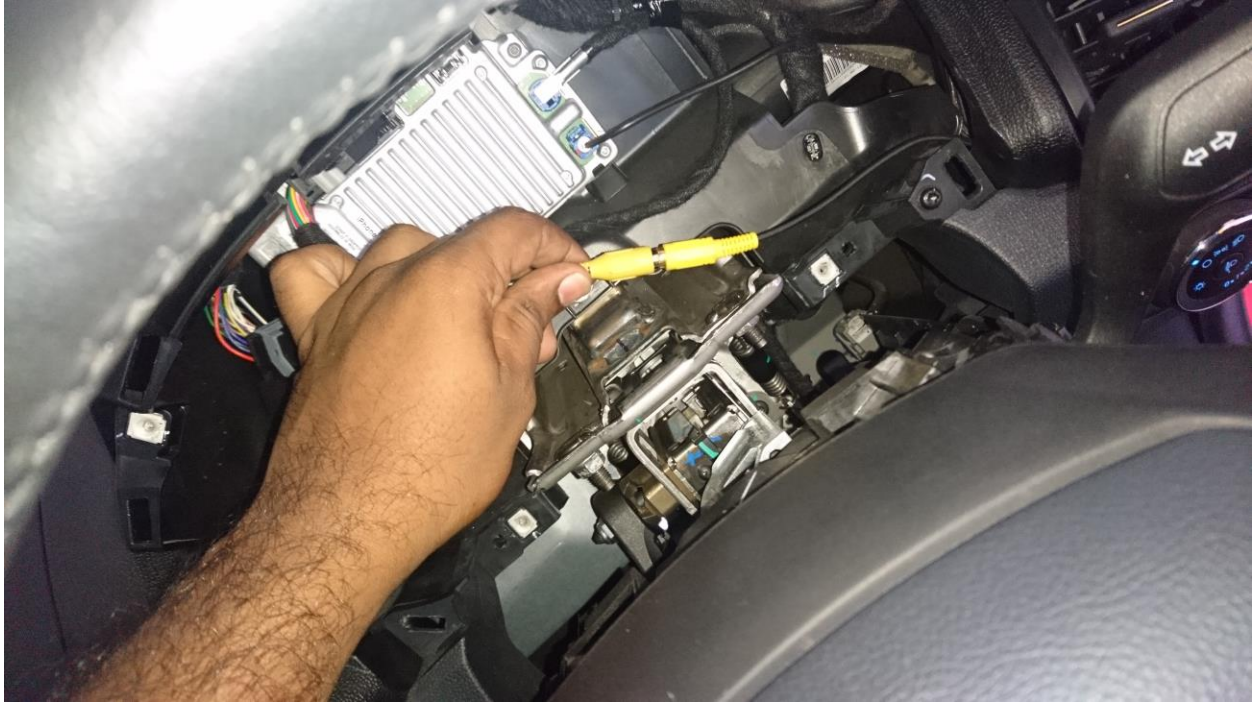
12. Connect the female AV cable to male pin of APIM Connector .