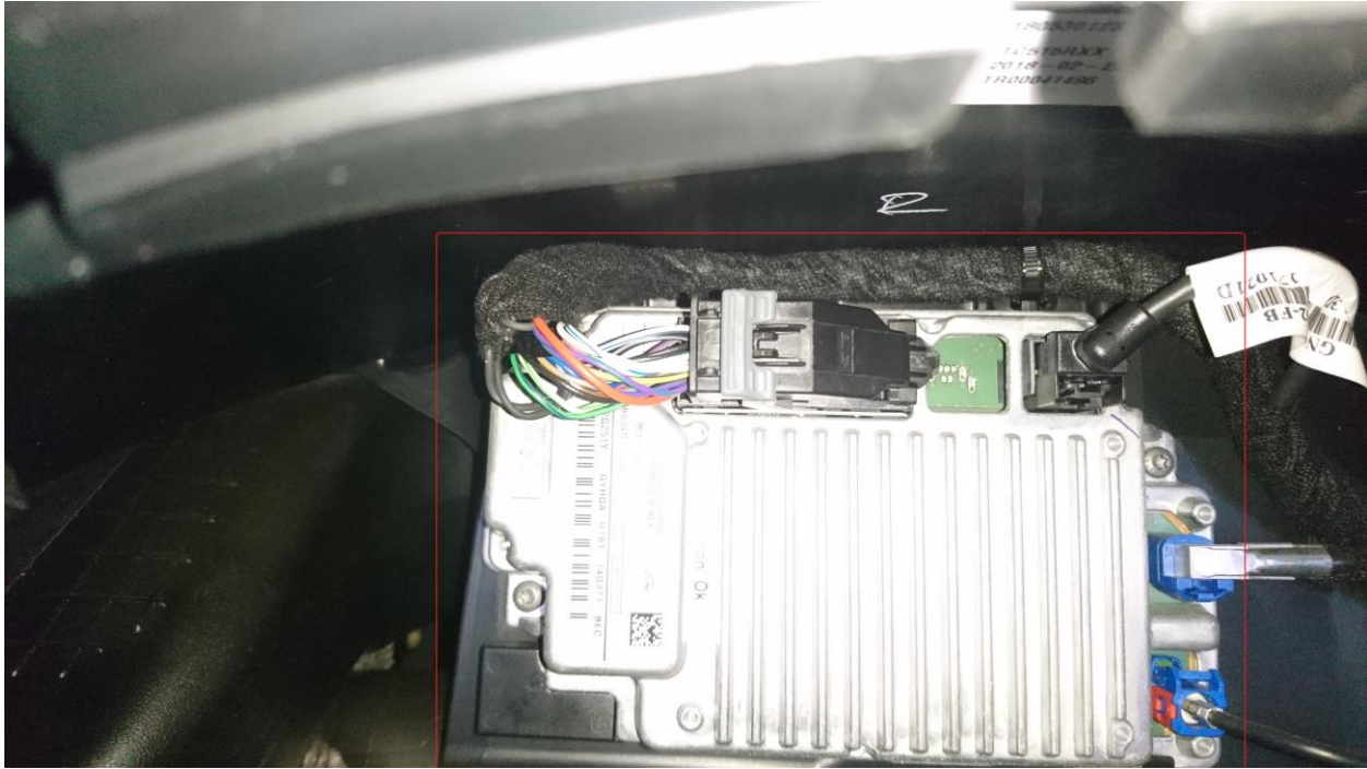
5. This is the SYNC / APIM module behind the instrument cluster .