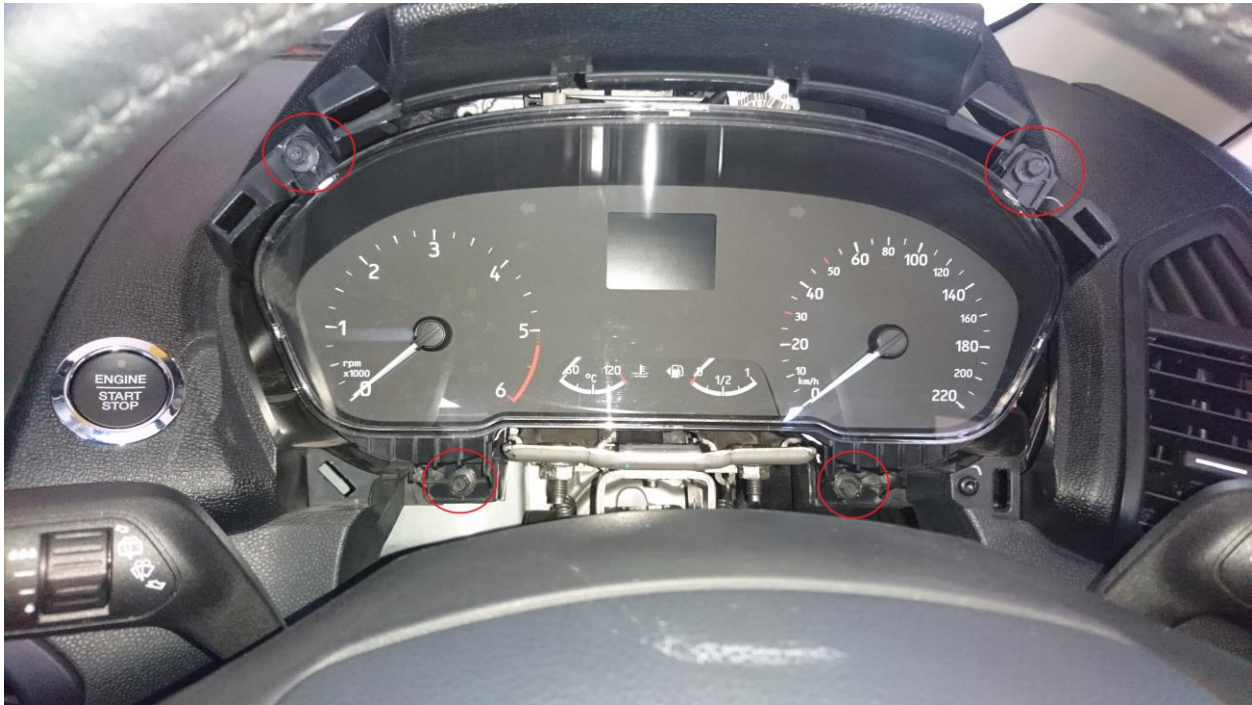
5. Remove the instrument cluster by removing the four screws.