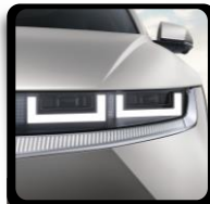
LED daytime running lights (DRL)