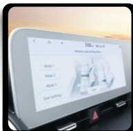
31.19 cm (12.3") touchscreen infotainment with navigation