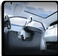
Sliding centre console