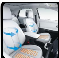
Ventilated & heated function