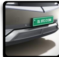
Active air flap (AAF)