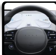
31.22 cm (12.3") Digital cluster