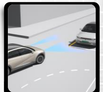
Hyundai SmartSense (L2 ADAS with 21 features)