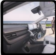
Dark pebble gray interior color