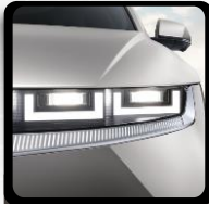
Parametric pixel LED headlamps