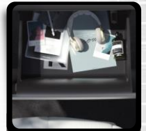
Sliding glove box