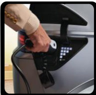
10-80% Charge in 18 mins (350kW)#