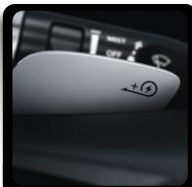
Smart regenerative braking system