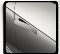
Auto flush door handles