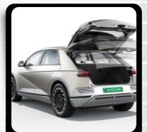
Hands free smart power tail gate with height adjustment