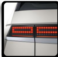
Parametric pixel LED tail lamps