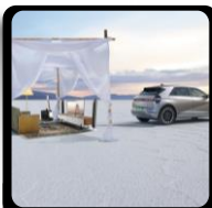
V2L (vehicle-to- load): inside and outside