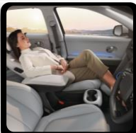
Premium front relaxation seats (Driver and passenger)