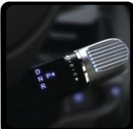
Column type Shift-by-wire