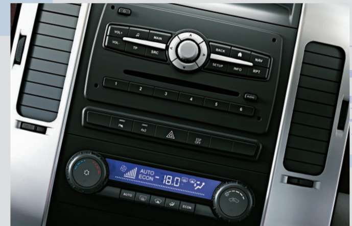
JBL by HARMAN Premium Sound System

What makes it exceptional is that the audio system is uniquely engineered and tailored to the Aria's interiors. It is acoustically tuned for optimum performance and delivers the best possible sound. The result is an outstanding musical treat for occupants of each seat.