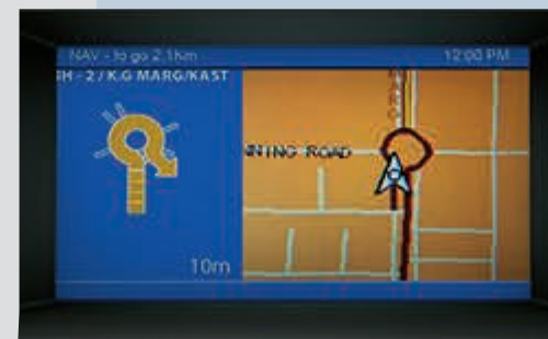
NAVTEQ Navigation system