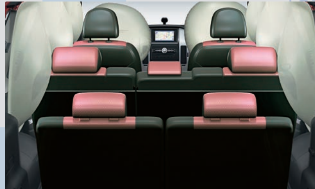
6 Air bags