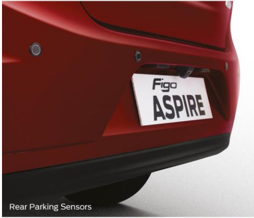
Rear Parking Sensors