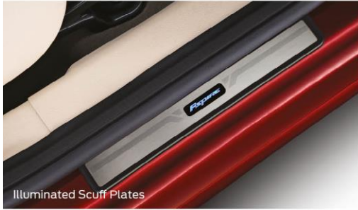
Illuminated Scuff Plates

Make your Figo Aspire even more unique with its range of accessories. We've got what you need when it comes to style.