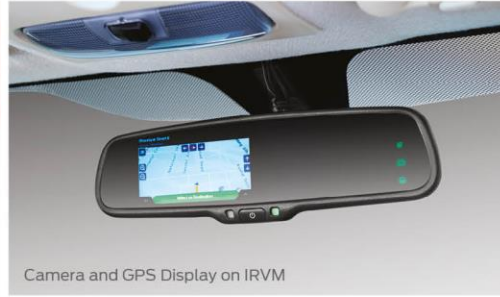
Camera and GPS Display on IRVM