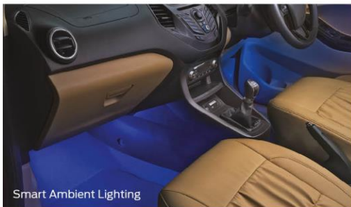
Smart Ambient Lighting