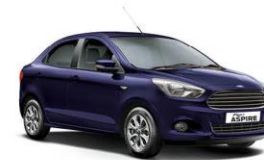
Deep Impact Blue