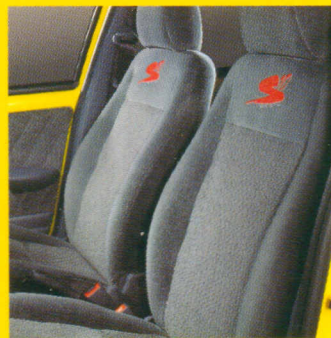
Exclusive S10 Upholstery