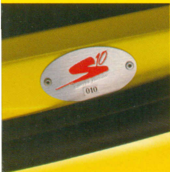
Serially Numbered Limited Edition Badge