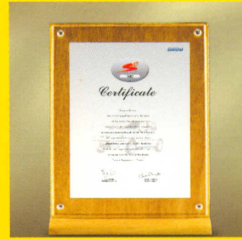
Personally Signed Certificate from Sachin

interiors of the car with just as much ease.