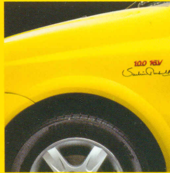
New Front Fender