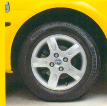
Specially Designed Alloy Wheels

All rolled-up in leather with special red stitching, the wheel gives you superb grip and control, just the way our hero enjoys it. Needless to say, all Palio S10s also bear Sachin's autograph and a serially numbered limited edition badge. But more than that, this car vows to take you closer to the man behind the bat.