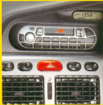
S10 Music System with Six Speakers