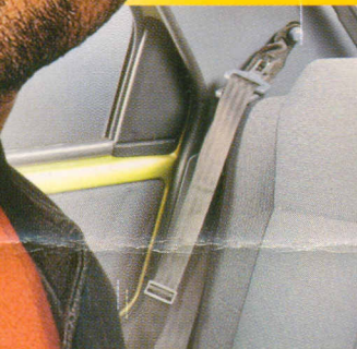
Rear seat belts