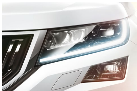
Full LED headlights