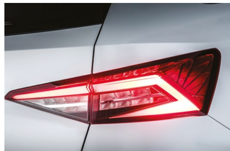
LED rear lights