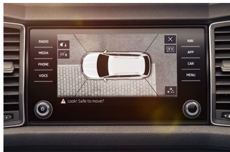
Area view camera