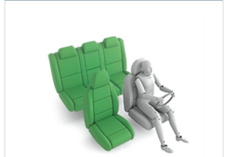
Römer King II LS (Belt)