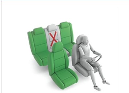
Maxi Cosi Cabriofix & EasyBase2 (Belt)