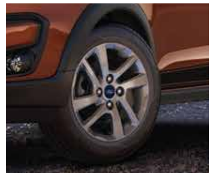
R15 Alloy Wheels

Other Accessories: Automatic Headlamps | Engine Undershield | Anti Theft Nuts | Neck Rest & Pillow | Rear View Camera | Roof Cross Bars | Smart Ambient Lighting | Shark Fin | Car Cover | Ash Tray