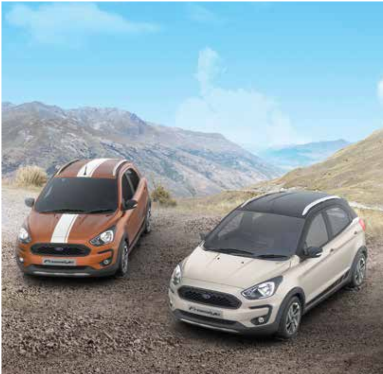
Body Stripe Kit & Roof Wrap

Crank up the style factor. Make your Ford Freestyle stand out from the crowd with our range of accessories.