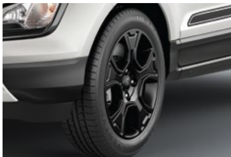
R17 (205/50 R17) Sporty Alloy Wheels