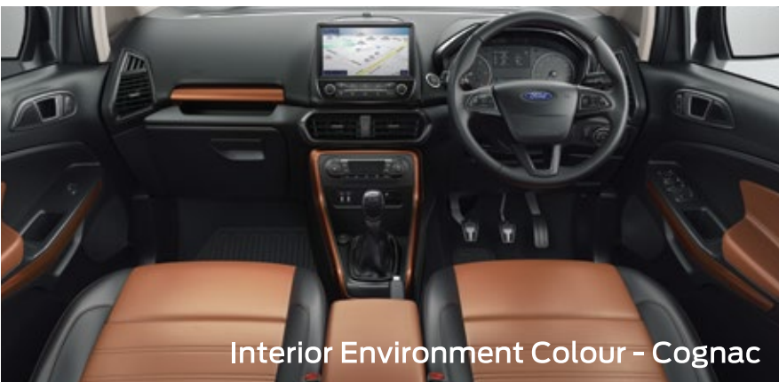
Interior Environment Colour - Cognac