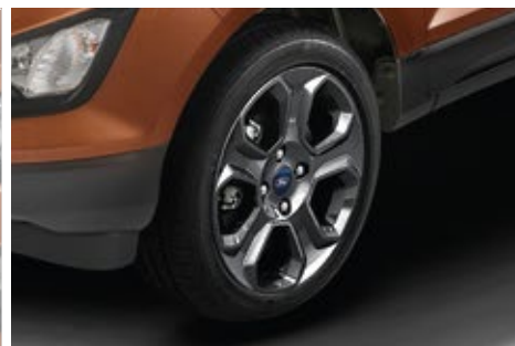
R16(205/60 R16) Sporty Alloy Wheels