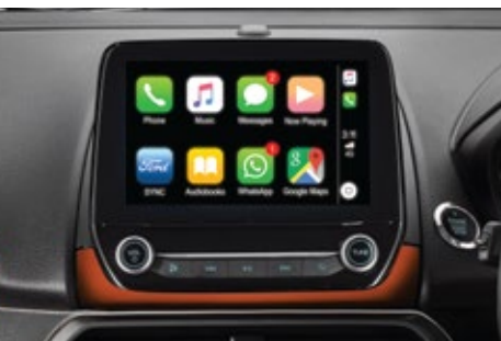
SYNC® 3 with 20.32cm (8.0) Touchscreen

With its breakthrough technology offerings, the Ford EcoSport seeks to change the game. The state-of-the-art tech is visible in all the facets of the car.