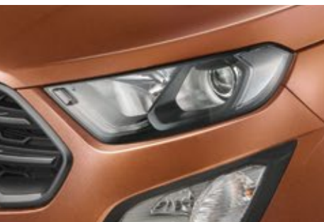
Bold HID Headlamps

With a bold exterior design, the Ford EcoSport always looks like it's ready for action. And yes, it knows how to turn heads!