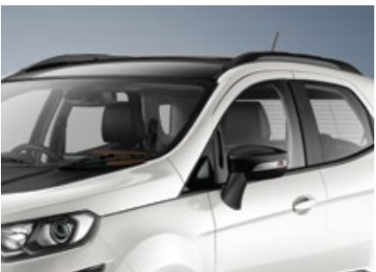
Electric Sunroof with Black Roof Rails