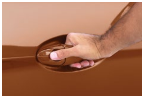
Push Start/Stop and Smart Entry with Capacitive Sensor