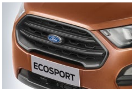
Stunning Grille Design