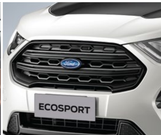
Bold Black Front Grille