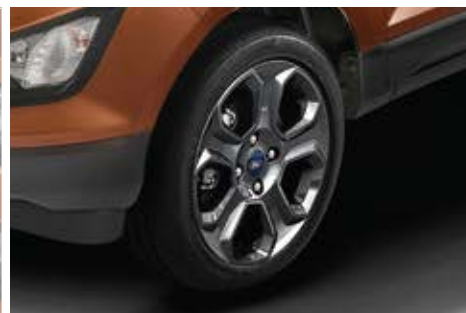
R16(205/60 R16) Sporty Alloy Wheels