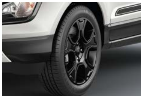
R17 (205/50 R17) Sporty Alloy Wheels