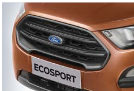
Stunning Grille Design