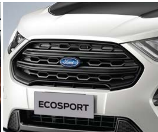
Bold Black Front Grille