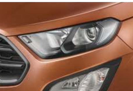
Bold HID Headlamps

With a bold exterior design, the Ford EcoSport always looks like it's ready for action. And yes, it knows how to turn heads!