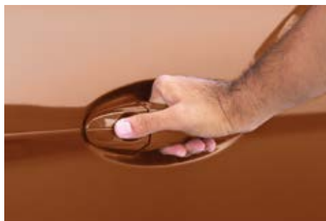
Push Start/Stop and Smart Entry with Capacitive Sensor