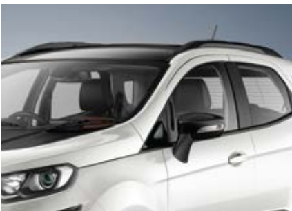
Electric Sunroof with Black Roof Rails