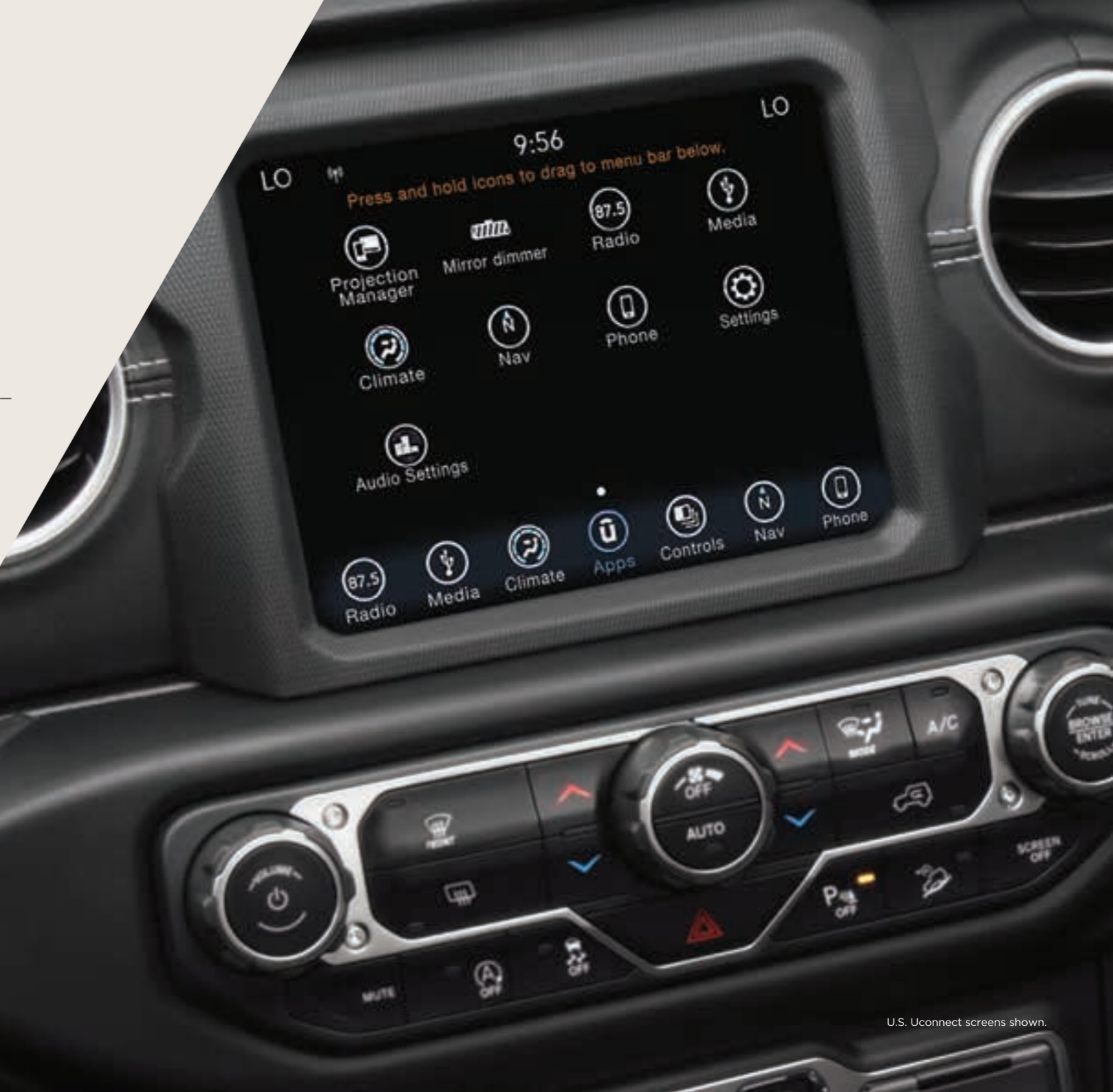
U.S. Uconnect screens shown.

Set temperature controls and so much more — all from the touchscreen. A drag-and-drop menu allows you to highlight your top six favorite features and services so they're always in sight on your 8.4-inch Uconnect® touchscreen display.