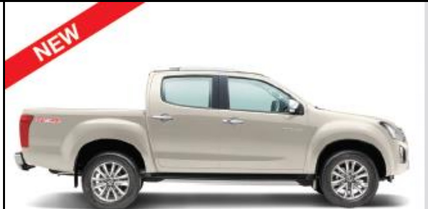
Silky Pearl White