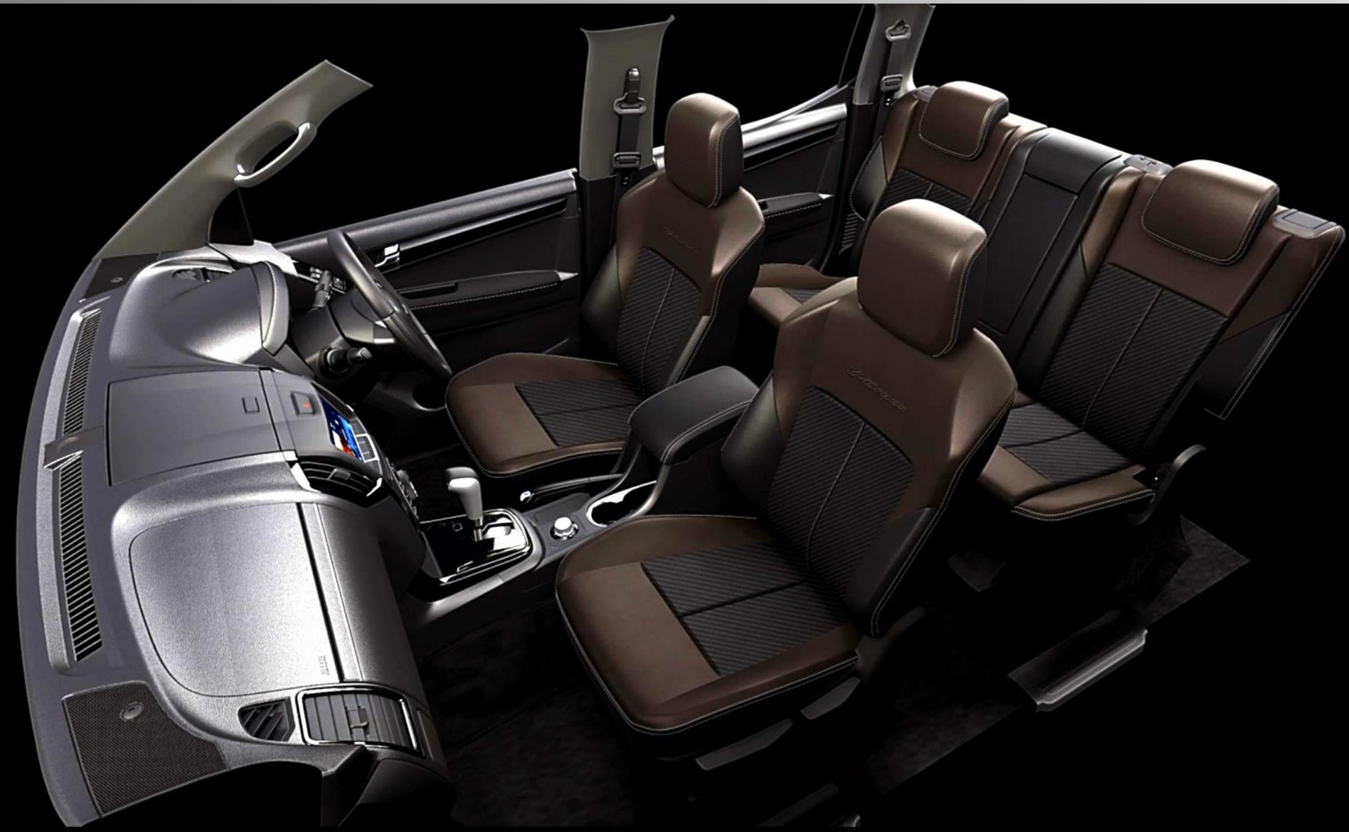
Dual-tone Brown & Grey Leather Seats