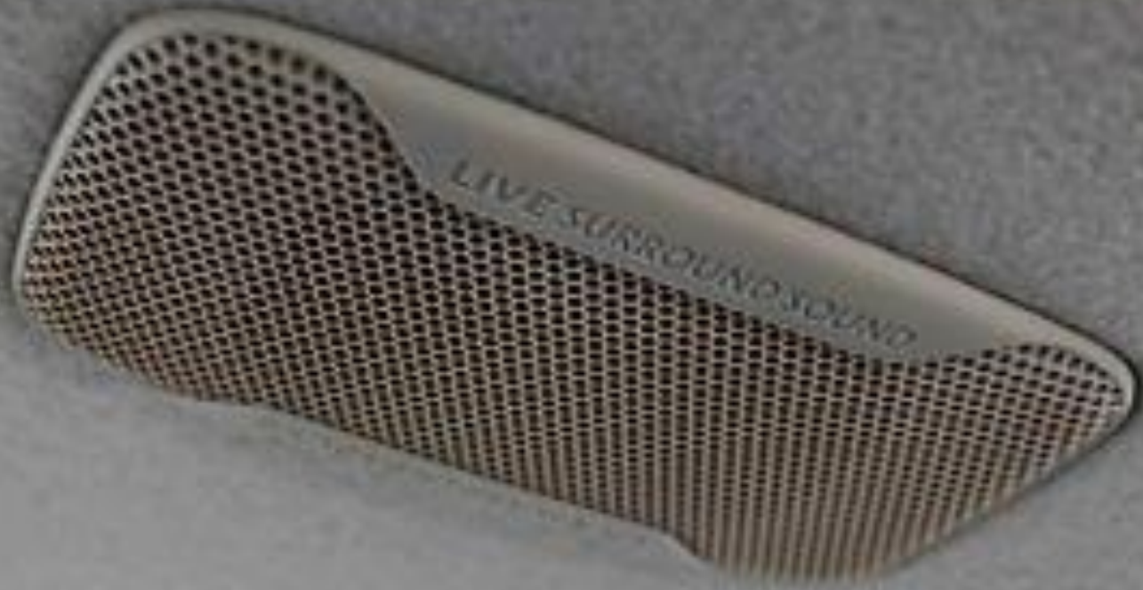
“Live Surround” Roof Speakers