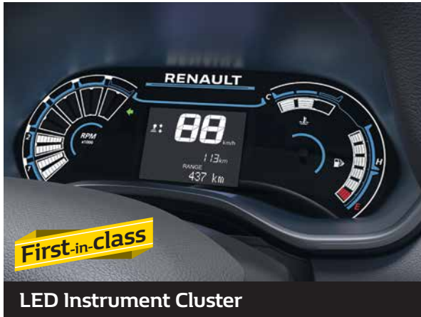
LED Instrument Cluster