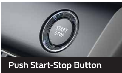
Push Start-Stop Button