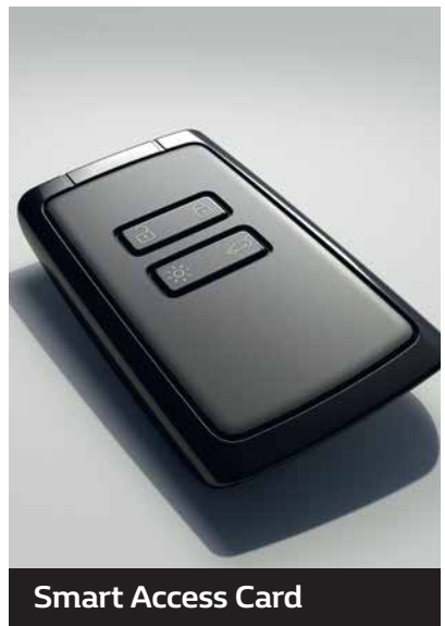
Smart Access Card

20.32 cm Touchscreen MediaNAV Evolution | Stylish Dual Tone Dashboard with Silver Accents