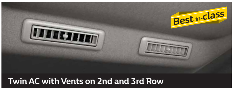
Twin AC with Vents on 2nd and 3rd Row