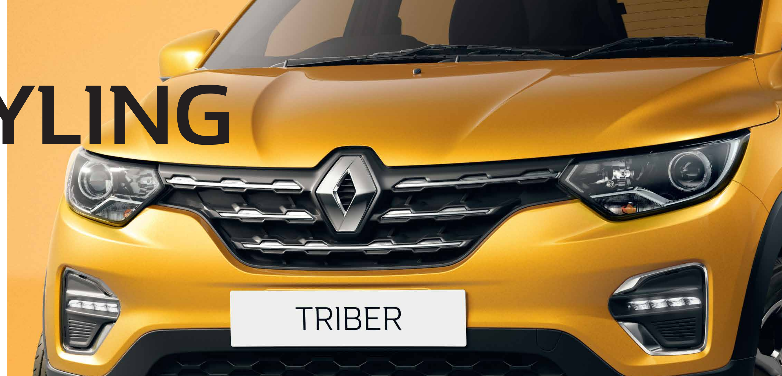
Triple Edge Chrome Front Grille | Projector Headlamps with LED DRLs

The Renault TRIBER is sure to catch attention with its striking Projector Headlamps, Stylish Roof Rails and LED DRLs. The 3-part ultra-modern Triple Edge Chrome Front Grille and Stylish Flex Wheels further add to its presence. A Ground Clearance of 182 mm and SUV Skid Plates lend an impressive stance while offering protection on rough roads.