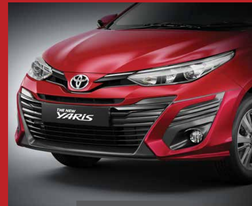
Make Your Mark