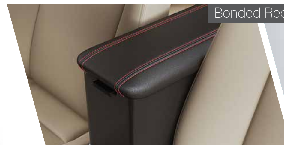
Bonded Red Stitch