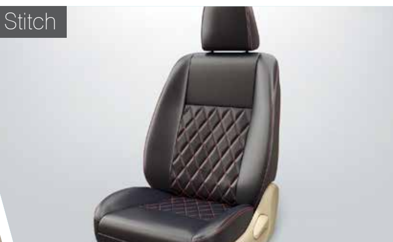
Art Leather Seat Covers