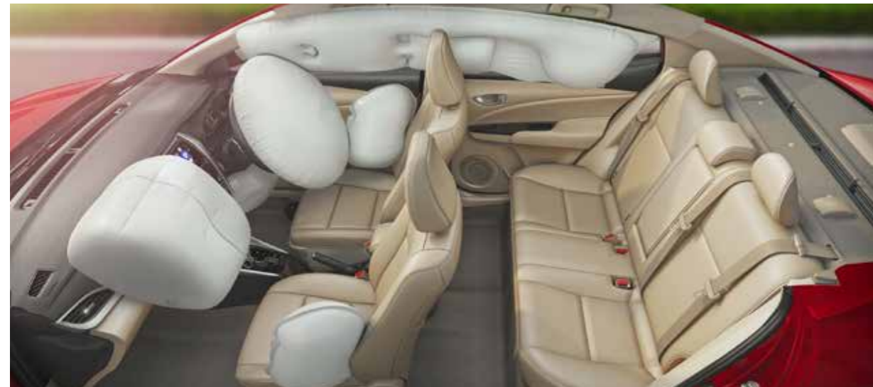
7 SRS Airbags