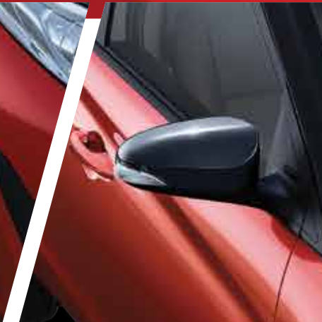
Glossy Black ORVM