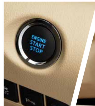
Push Start Stop Button