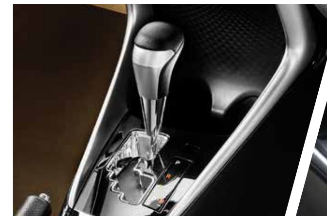
7 Speed Super CVT-i in all Variants

An ultra-responsive engine delivers peak torque at lower power bands for an effortless drive. With enviable options like the 6 Speed MT and the advanced 7 Speed CVT-i for seamless gear changes that use superior technology resulting in better fuel efficiency compared to conventional automatic transmission, the Yaris is powered for any and every kind of performance desired; best described by one word - peerless.