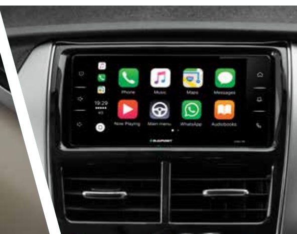
Android Auto & Apple CarPlay Audio#