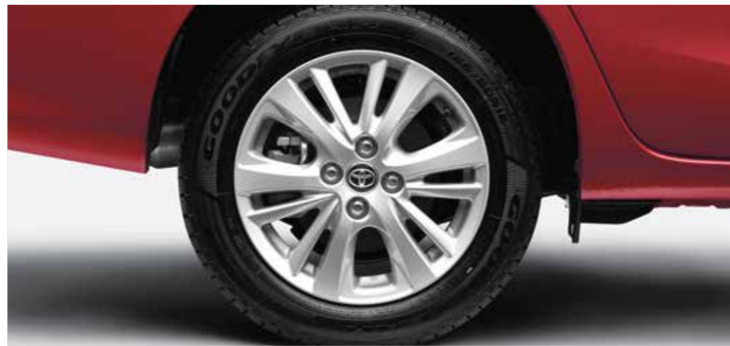
All 4 Disc Brakes

As with every Toyota, the new Yaris is loaded with a multitude of safety features ranging from 7 SRS Airbags to Tyre Pressure Monitoring System. It also comes equipped with additional safety features like Vehicle Stability Control, Hill-start Assist Control, Disc Brakes on all 4 wheels, Front and Rear Parking Sensors, Automatic Headlamps and a Reverse Camera to reinforce the reputation of being safety leaders.