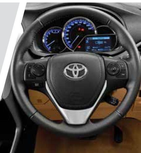
Leather Wrapped Steering