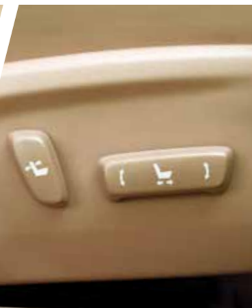
Power Driver Seat