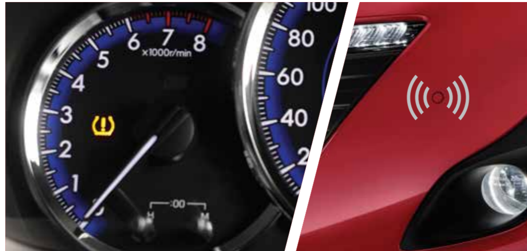
Tyre Pressure Monitoring System