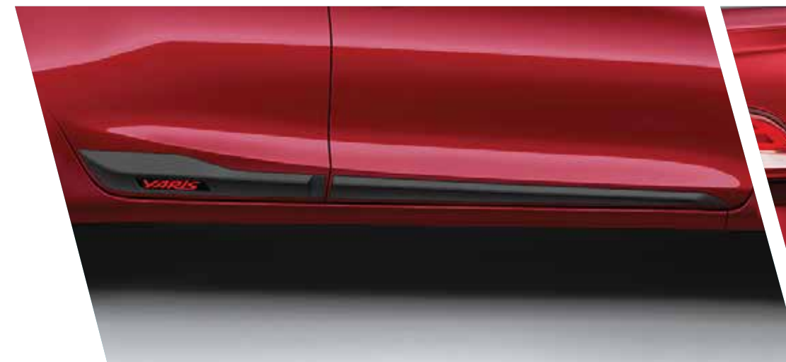
Side Moulding with Sporty Red Accent