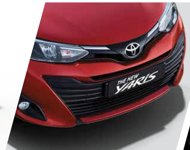
Glossy Black Grille