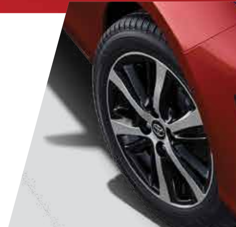
Diamond Cut Alloys