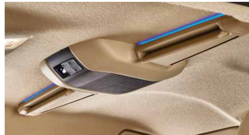
Roof Mount Air Vents with Ambient Illumination