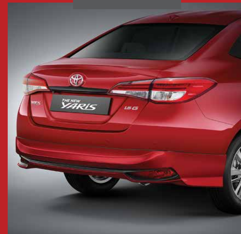
Rear Bumper Spoiler