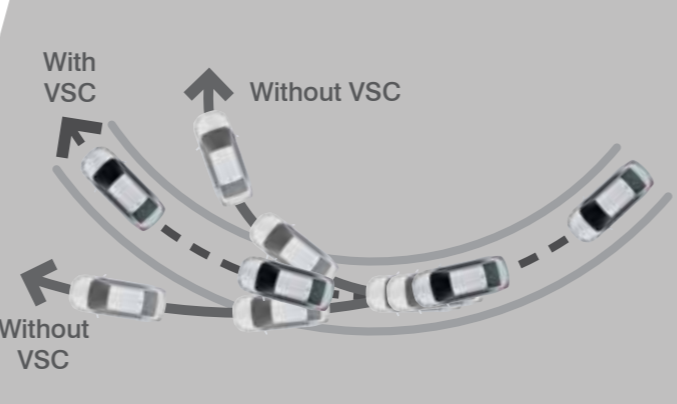
Vehicle Stability Control