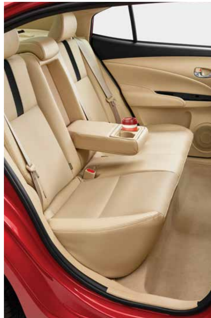
Enhanced Rear Seat Comfort