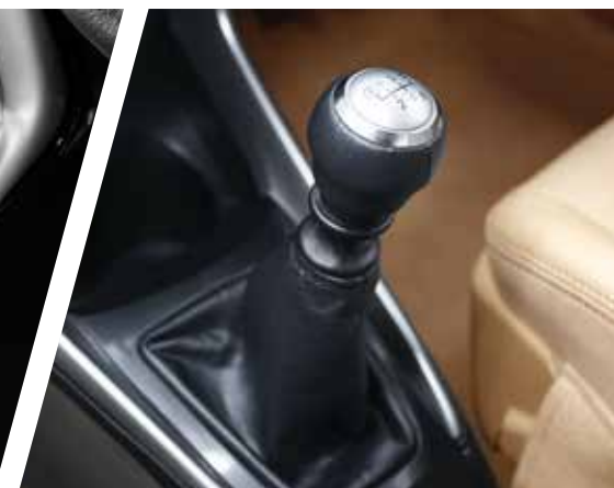
6 Speed Manual Transmission