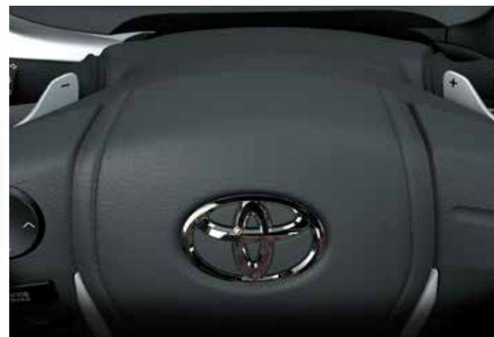
Cruise Control + Paddle Shift