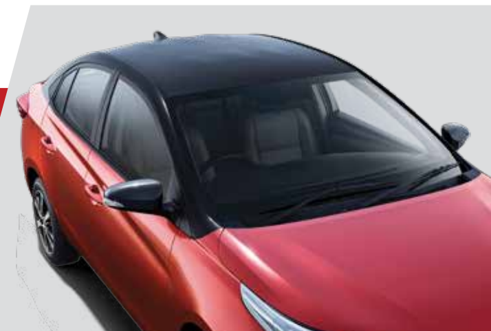
Dual Tone Exterior