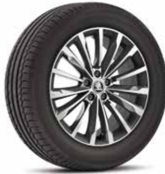
DUAL TONE ANTHRACITE R(18) TRINITY ALLOY WHEELS SCOUT