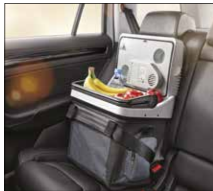
THERMO-ELECTRIC COOLING BOX (20L) WITH CAR BATTERY VOLTAGE GUARD (000 065 400G)