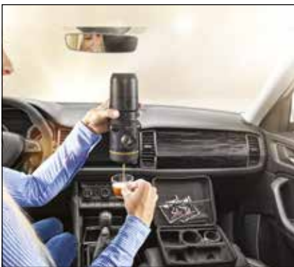
PORTABLE COFFEE MAKER (000 069 641C)