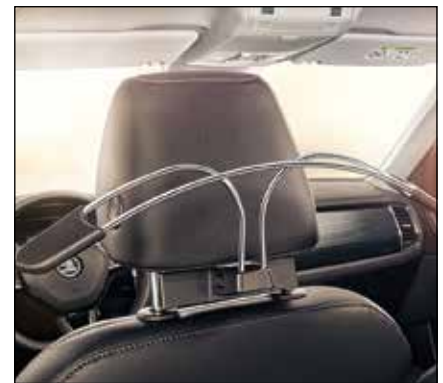
SMART HOLDER - HANGER (3V0 061 127)