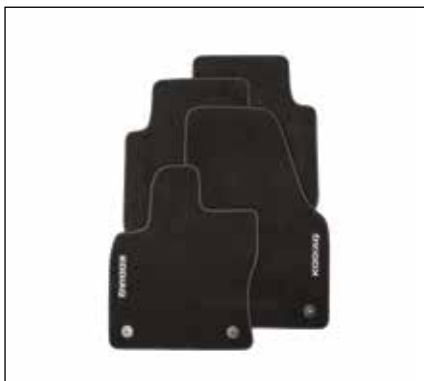
TEXTILE FOOT MATS STANDARD FOR 1 ST AND 2 ND SEAT ROW RHD (567 061 404)