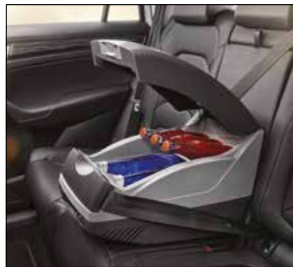
THERMO-ELECTRIC COOLING BOX (15 L) (5L0 065 400)