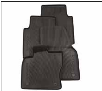
ALL-WEATHER INTERIOR MATS