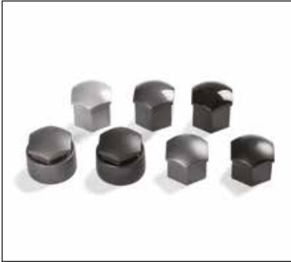
BOLT COVERS BLACK MATT (1Z0 071 215 01C), SILVER METALLIC (1Z0 071 215 7ZS), BLACK GLOSS (1Z0 071 215 989), GREY GLOSS (1Z0 071 215 UZ7), GREY MATT (1Z0 071 215 Z37), FOR WHEELS WITH SAFETY BOLTS BLACK MATT (1Z0 071 215A 01C), GREY MATT (1Z0 071 215A Z37)