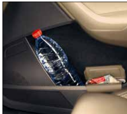
DOOR BIN PANEL - BEIGE