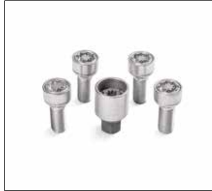
SAFETY BOLT SET THE BOLTS REQUIRE A SPECIAL ADAPTOR TO BE UNSCREWED TO AVOID UNAUTHORIZED WHEEL REMOVAL (000 071 597C)