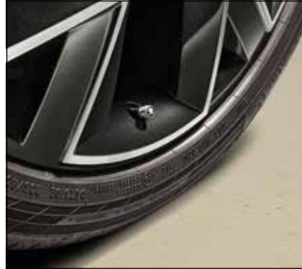
DECORATIVE VALVE CAPS (000 071 215C)