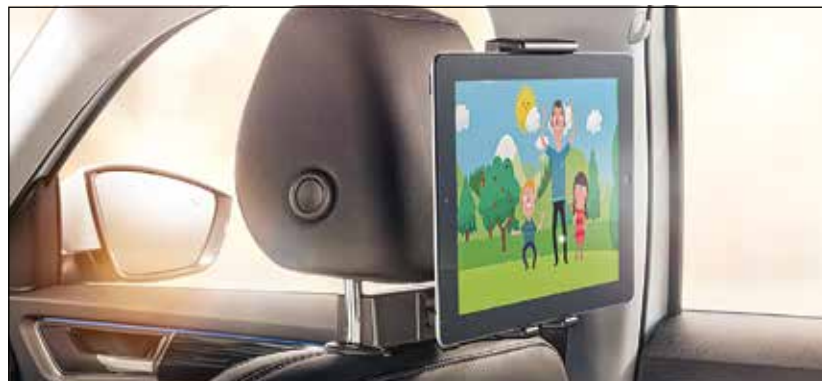
SMART HOLDER - MULTIMEDIA HOLDER (3V0 061 129)