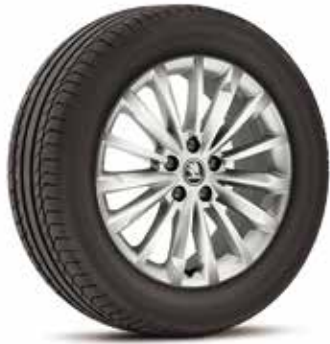
R(18) TRINITY ALLOY WHEELS STYLE AND L & K