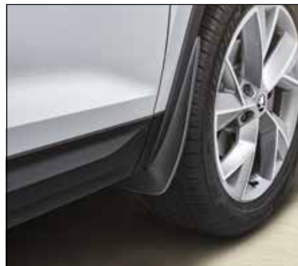
FRONT MUD FLAP