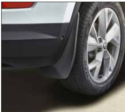
REAR MUD FLAP