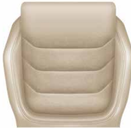
STYLE BEIGE LEATHER STYLE AND L & K