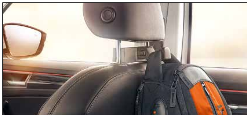
SMART HOLDER - HOOK (3V0 061 126)