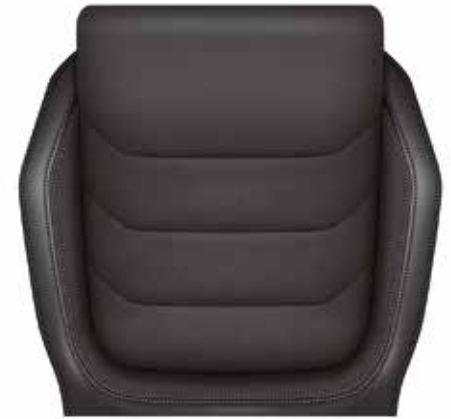
BLACK ALCANTARA® LEATHER SCOUT