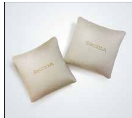
PREMIUM CUSHION PILLOWS (SET OF 2 PCS)