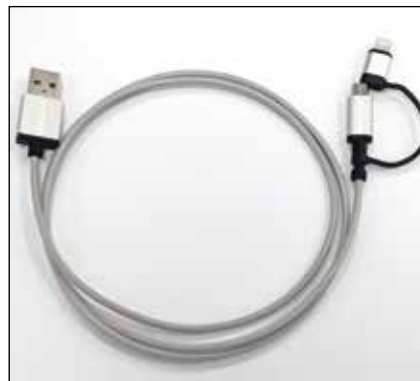
DUAL PORT CABLE