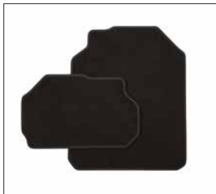
TEXTILE FOOT MATS FOR 3 RD SEAT ROW RHD (567 061 270 A)