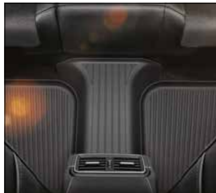
ALL-WEATHER MAT - TUNNEL