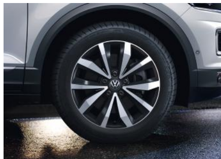
Image of left hand drive car is provided for representation purpose only. Accessories and features shown may not be a part of the standard equipment or may not be offered in India.

Eye-catching alloy wheels give the T-Roc design a distinctive look.