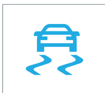
Electronic Stability Control