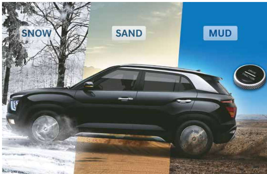
Traction Control Mode (Snow, Sand, Mud)

With the new 1.4l Petrol, 1.5l Petrol and 1.5l Diesel BS6 engines under the hood, the All New CRETA delivers a power packed performance on every terrain. Be it on the road or off it, the All New CRETA has the dynamism to go the distance.