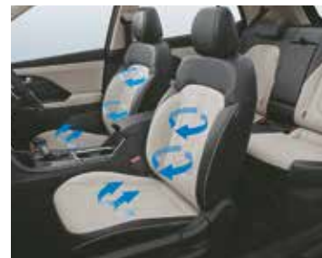
Front Row Ventilation Seats