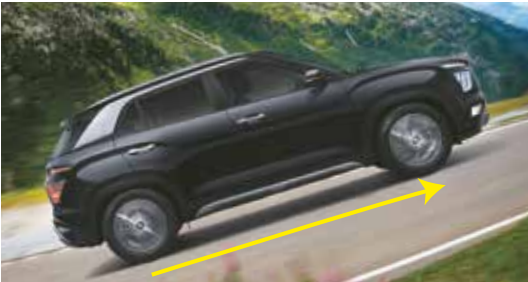
Hill Start Assist Control (HAC)