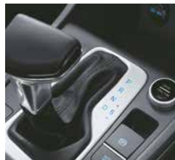
7-speed DCT, 6-speed Automatic Transmission & IVT