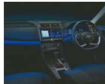
Soothing Blue Ambient Lighting