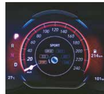
Drive Mode Select (Eco, Comfort & Sport)