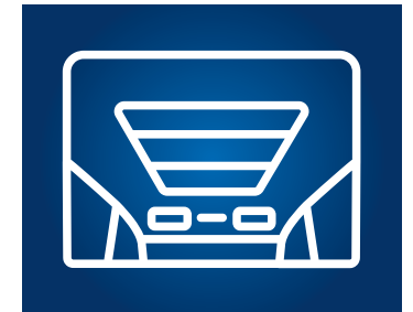
Voice Operated Open/Close Sunroof*

BlueLink with 50+ Features Your Connected Friend on the Go