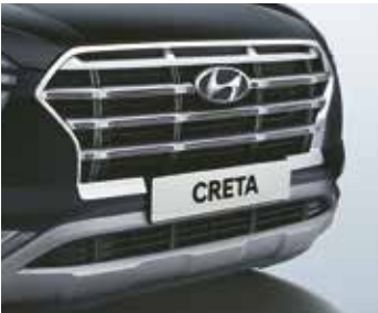
Signature Cascading Grille

With a breathtakingly beautiful and edgy design, the All New CRETA has been crafted to command respect. The bold exterior and the new masculine stance will set you apart from every other SUV on the road. No matter where you decide to go, the All New CRETA will help you stay one step ahead on the road.