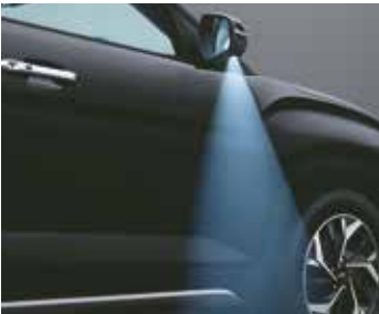
Welcome Function with Auto Unfold ORVM's & Puddle Lamps