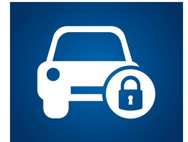
Stolen Vehicle Tracking, Notification & Immobilization*