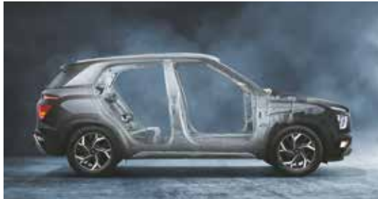
Strong Body Structure with AHSS