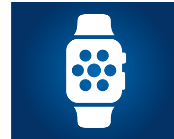
Connected Car Features in Smart Watch App*