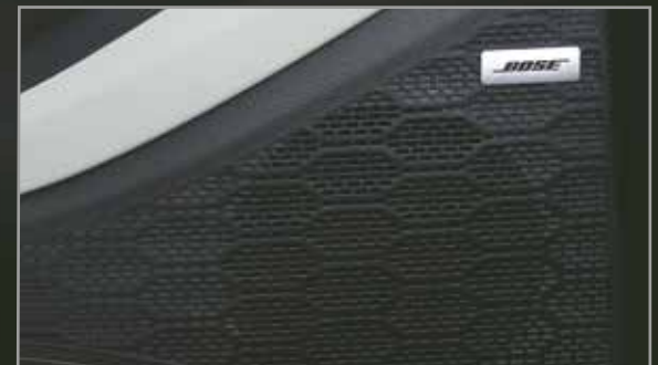
Bose Premium Sound System (8 speakers)