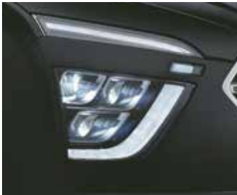
Trio Beam LED Headlamps with Crescent Glow LED DRLs