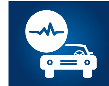
Monthly Health Report