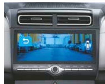
Driver Rear View Monitor

Savor the awe inspiring beauty all around when you get in the All New CRETA. The plush new interiors give you the advantage of extra comfort on every ride. Breathe in the wonders of nature and relish exquisite scenic views as you make your way across all-terrains of life.