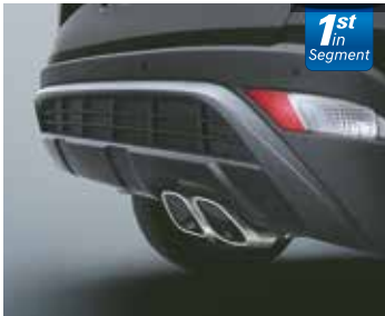
Twin Tip Exhaust (Turbo Only)