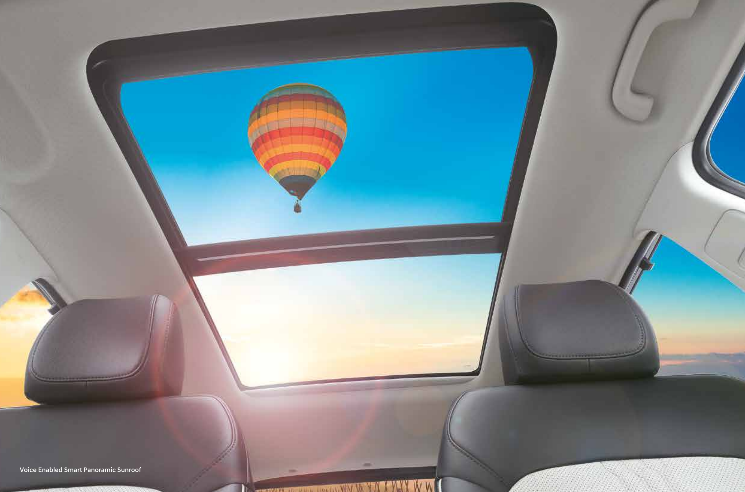
Voice Enabled Smart Panoramic Sunroof