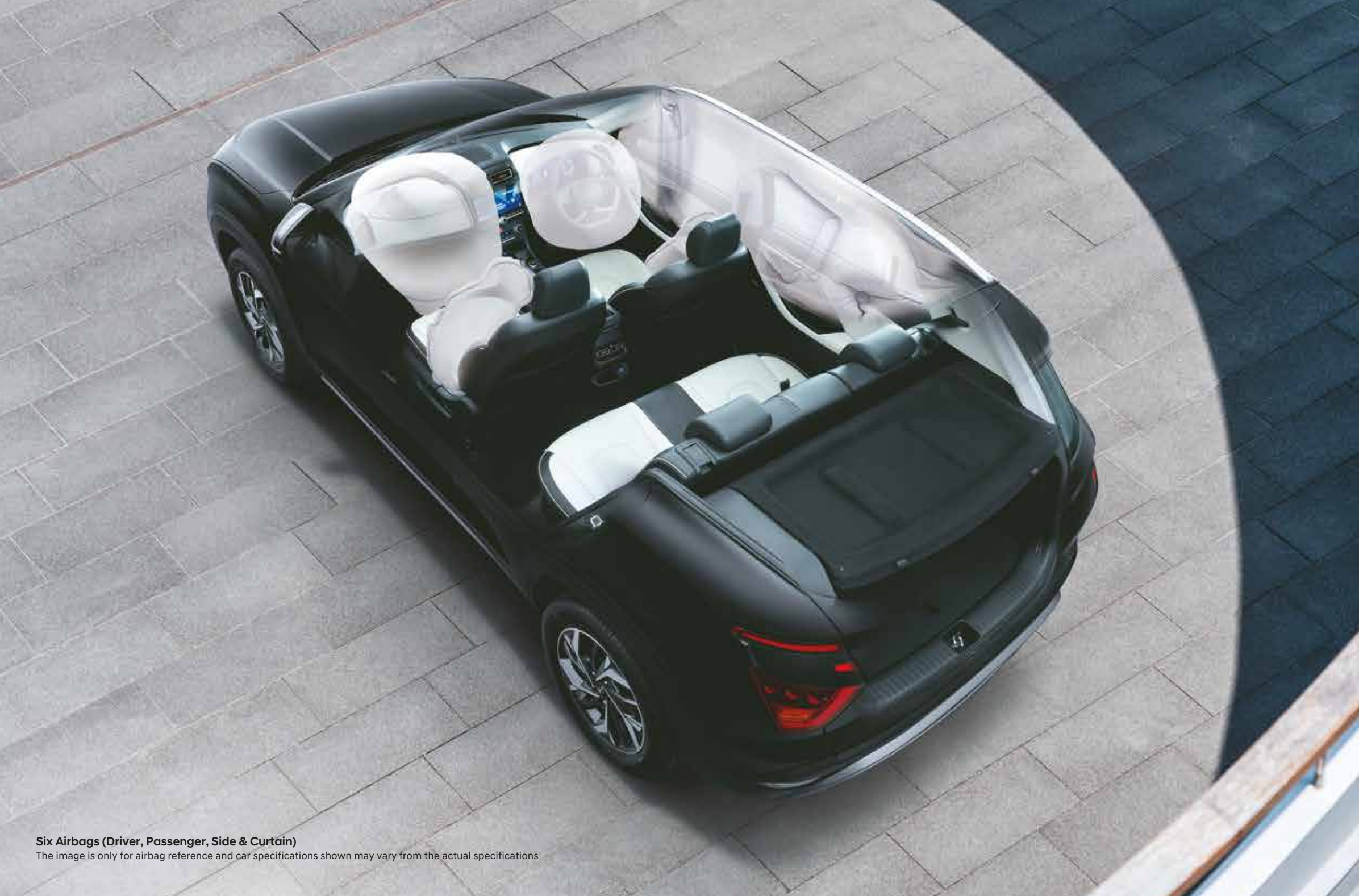
Six Airbags (Driver, Passenger, Side & Curtain) The image is only for airbag reference and car specifications shown may vary from the actual specifications