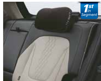
Rear Seat Headrest Cushion