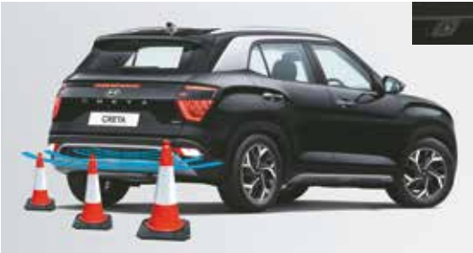
Rear Parking Sensors with Camera