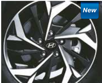
Rear Disc Brakes