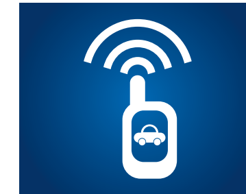
Remote Engine Start/Stop (AT/DCT & MT)

The All New CRETA is equipped with Advanced Blue Link featuring the new In-Car Voice Command Technology. Now with an app on your smart watch and smartphone you have the power to control your car from anywhere. Stay ahead of the curve with the latest features like Remote Engine Start Stop, Destination Sharing, Climate Control and more.