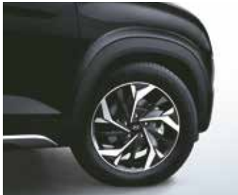
R17 Diamond Cut Alloys