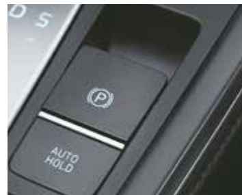
Electric Parking Brake with Auto Hold