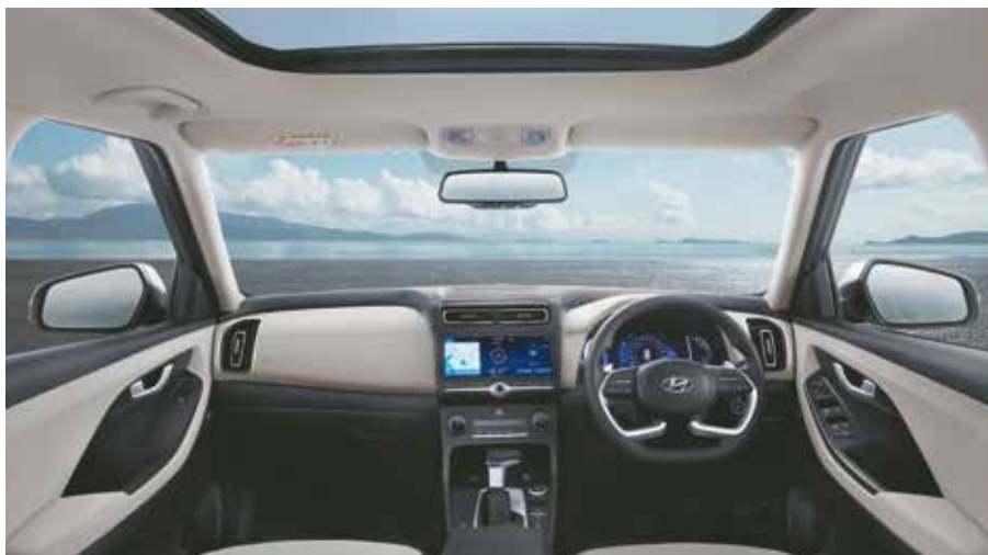
Two Tone Black & Greige Interiors