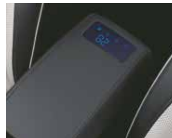
Auto Healthy Air Purifier

Leather Wrapped D-Cut Steering Wheel | Leather TGS Knob | Automatic Headlamps | Smart Phone Wireless Charger Electro Chromic Mirror (ECM) | Door Scuff Plates – Metallic | Rear Window Sunshade | Power Driver Seat - 8 way 17.78 cm Supervision Cluster with Digital Display | Cruise Control | 2-Step Reclining Rear Seat | 60:40 Split Rear Seat