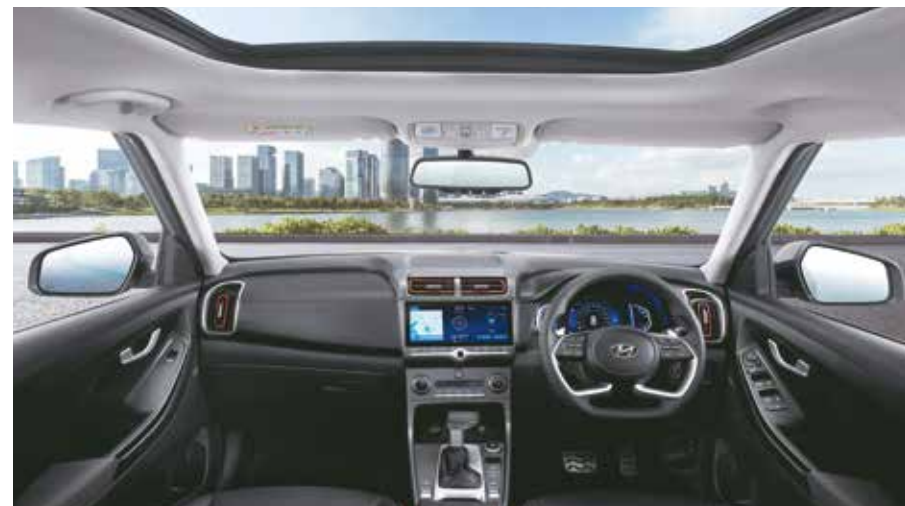
All Black Interiors with Orange Color Pack