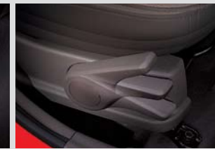
Driver Seat Height Adjuster

The Next Gen i10 is simply irresistible and speaks volumes about class and innovation from every angle. The first-in-class turn indicators on the outside mirrors with heated function, the electric adjustable mirrors and electric sunroof lend a touch of luxury to this Next Gen phenomenon. While the automatic transmission ensures a hassle free drive, the bluetooth connectivity, steering wheel remote, USB port and driver seat height adjuster make the drive convenient, providing ultimate driving pleasure.