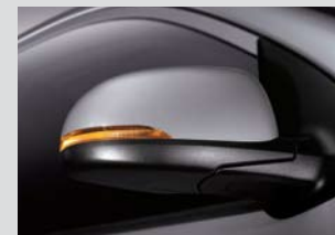
Outside Mirror Turn Indicators