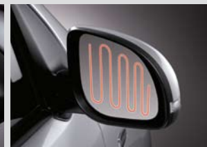
Electric Heated and Adjustable Outside Mirror