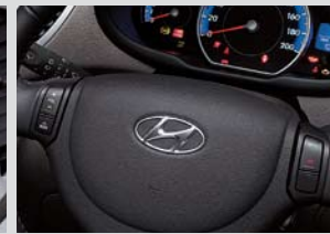
Steering Audio and Bluetooth Control