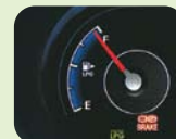
LPG fuel gauge