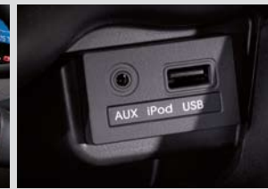
Aux and USB Ports