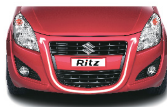
■ New Smiling Front Design