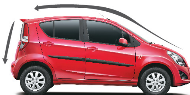
■ Unique Tail Boy Design