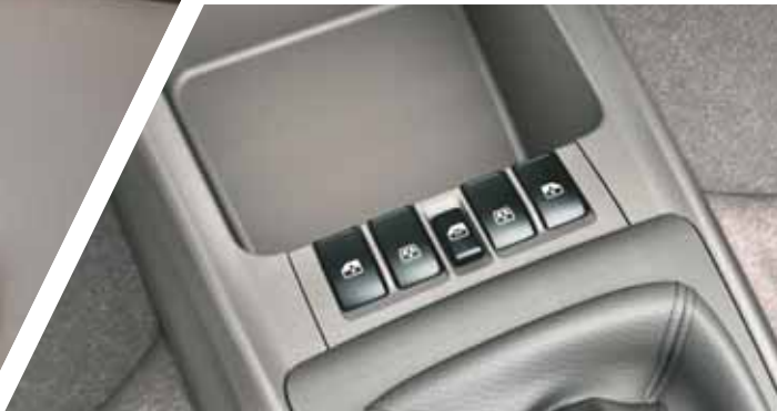
4 Door Power Windows: For comfort and convenience of operating windows at the touch of a button.