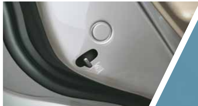
Child Protection Rear Door Locks: Prevent inadvertent door opening to protect your little ones.