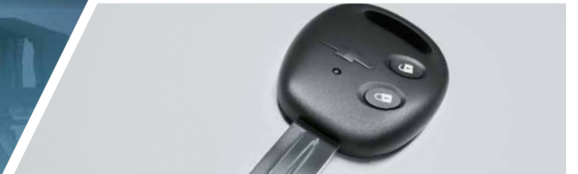
Engine Immobilizer with Remote Keyless Central Door Locking: For enhanced security of your car.