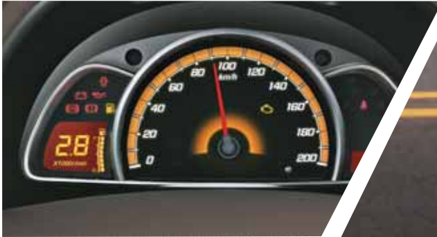
Rising Sun Style Instrument Cluster: With a Digital Tachometer.