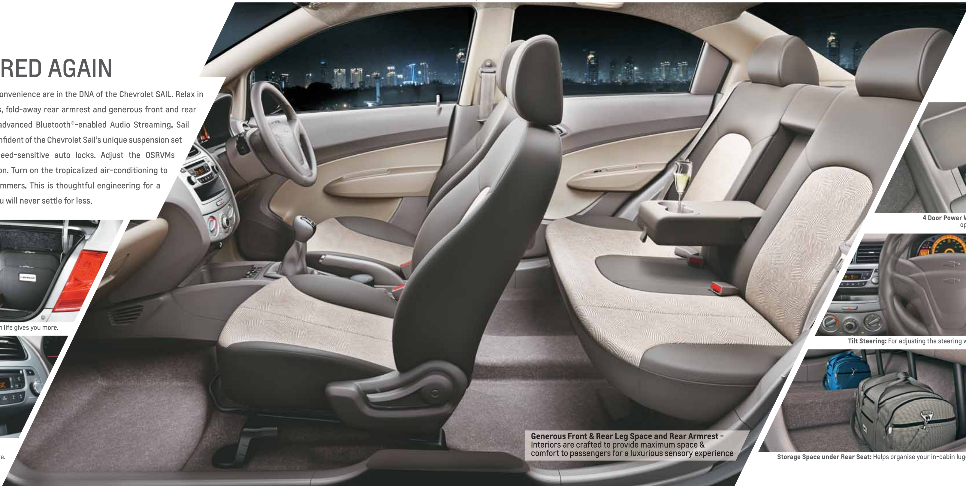
Generous Front & Rear Leg Space and Rear Armrest – Interiors are crafted to provide maximum space & comfort to passengers for a luxurious sensory experience