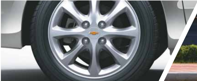
Alloy Wheels: Stylish & sporty 8 Spoke, 14 inch alloy wheels enhance appeal & performance.

The Chevrolet SAIL belongs to those who stand out. An aggressive and macho front styling based on the Dynamic Sculpture Design philosophy, along with its wide stance lends it an unmatched grace and awe inspiring presence. Elegant finish and broad shoulders apart, the muscular physique of the Chevrolet SAIL gets glamour to the grace with its elegant wide-angled jewel-effect tail lamps and wrap around head-lamps. The stunning Chevrolet Corvette inspired Dual Cockpit Interior Design with a refreshing Rising Sun instrument cluster, luxuriously blended two tone interiors with highlights in silver and chrome, define the overall appeal and charm of the Chevrolet SAIL that commands respect and envy both at the same time.