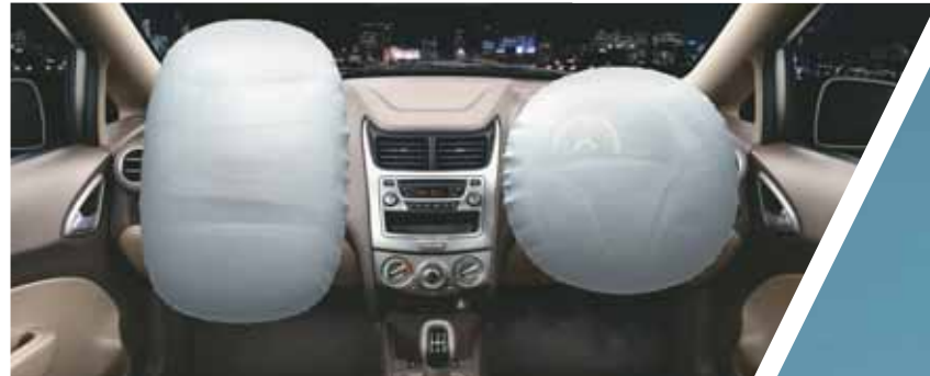
Dual Airbags: Cushion the front seat occupants & provide protection during high speed frontal impact.

The Chevrolet SAIL comes with an unmatched set of active and passive safety features. Its Safe-Cage Design with a 3-point force dispersion structure with in-built crumple zones and side impact beam in doors provides enhanced safety for the cabin occupants. The centrally-located fuel tank fortified by cross-structures is an added protection in case of a side impact. Made of sterner stuff, well it's true.