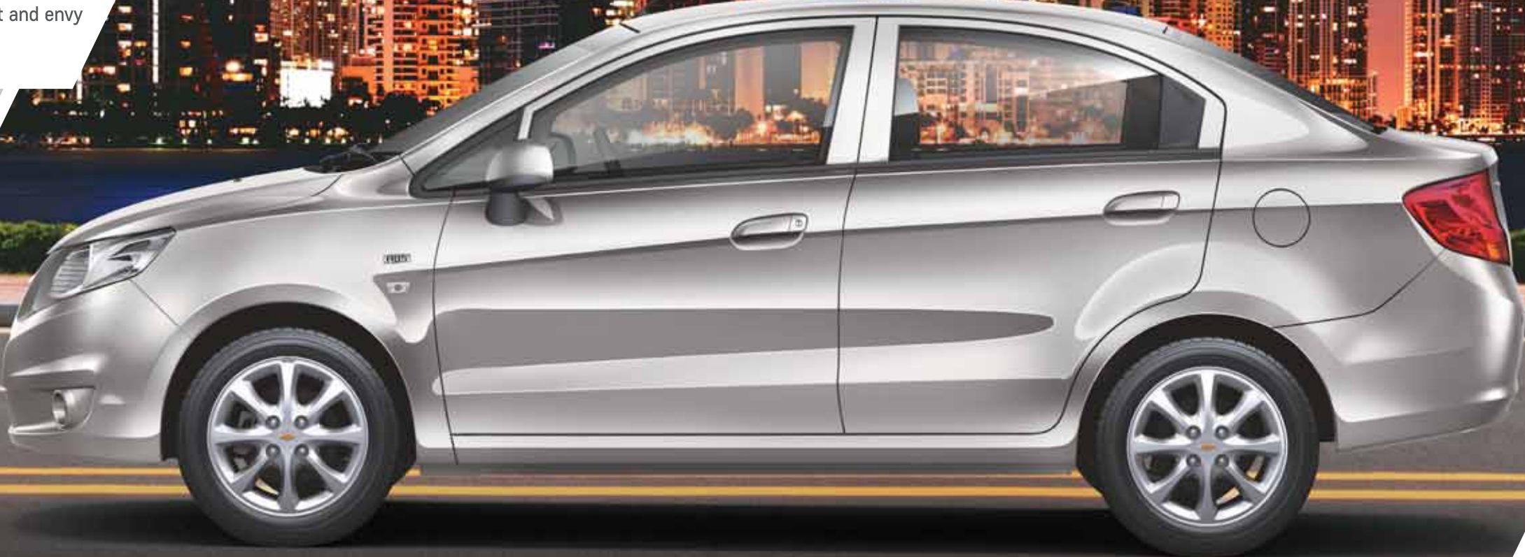
Dynamic Sculpture Design