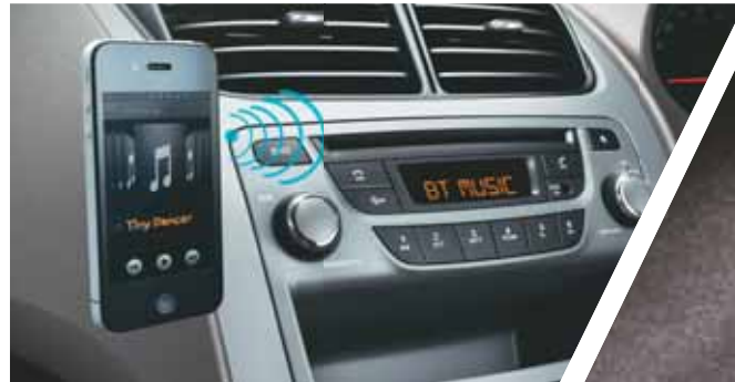
Fun Wide Audio System: Bluetooth® enabled Music Streaming & Mobile Hands-free system transforms your car into a jukebox on the move.