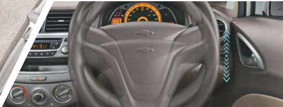
Tilt Steering: For adjusting the steering wheel angle for enhanced driving comfort.