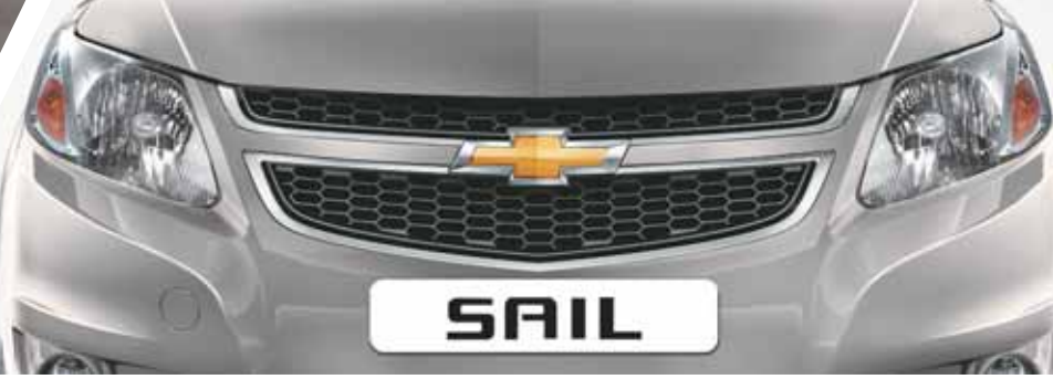
Dynamic Sculpture Design with Bold Front-end Styling: Adds premium appeal to the aggression of the taut and sculpted form.