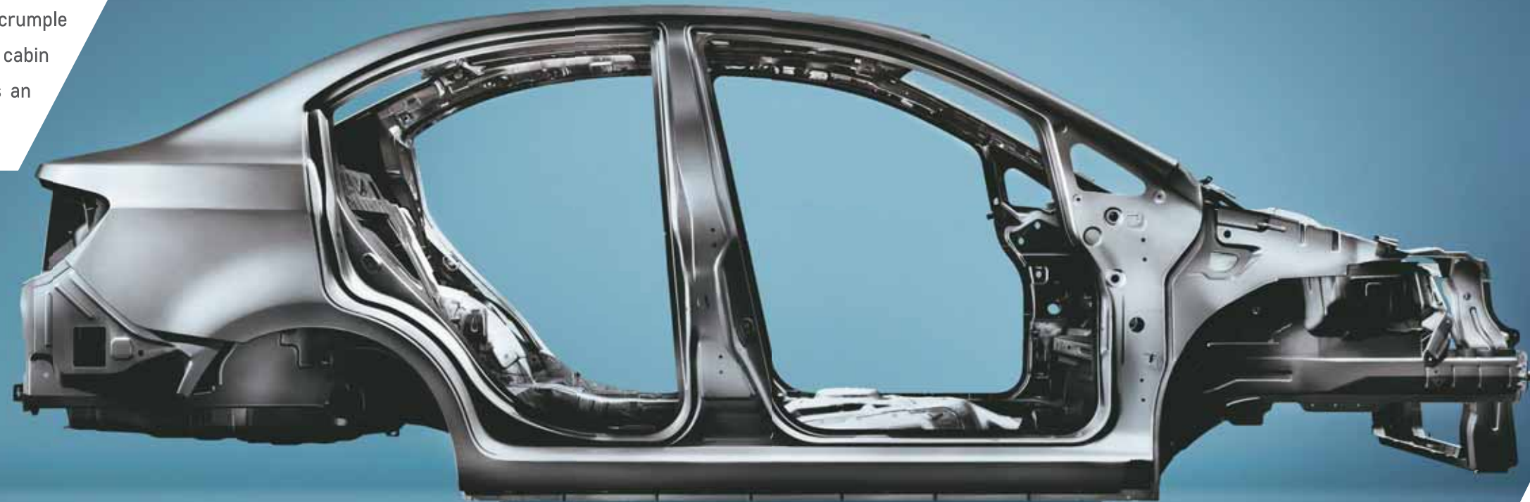
Chevrolet Safe-Cage Design - Cocoon of safety