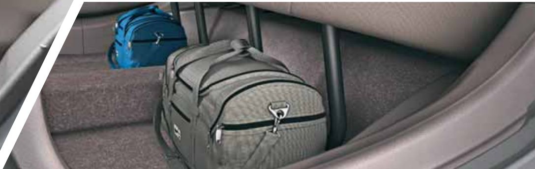
Storage Space under Rear Seat: Helps organise your in-cabin luggage without having to stow it in the boot.