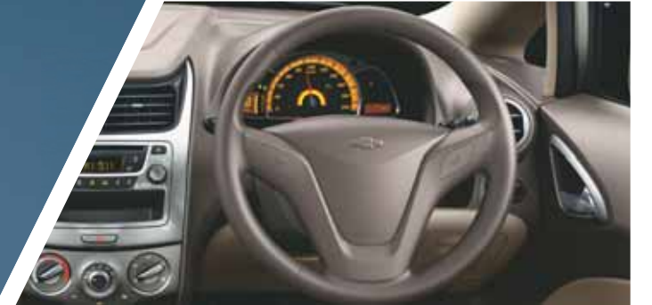
Collapsible Steering: An additional safety feature for driver protection in case of frontal impact.