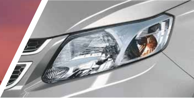
Hawk-Wing Style Front Headlamps: Add a swanky dimension & visual impact of the bold front styling.