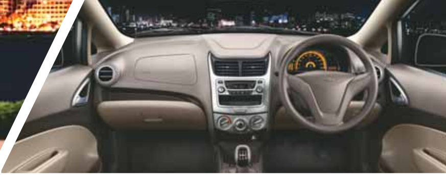
Chevrolet Corvette-Inspired Dual Cockpit design: With wide horizon view dash design enhances functional & aesthetic interior appeal.