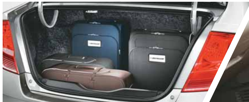
Superior Boot Space: To fit in your world when life gives you more.

Luxurious Comfort and Ergonomic Convenience are in the DNA of the Chevrolet SAIL. Relax in the comfort of well-supported seats, fold-away rear armrest and generous front and rear legroom. Enjoy the drive with the advanced Bluetooth®-enabled Audio Streaming. Sail comfortably over pot-holed roads confident of the Chevrolet Sail's unique suspension set up. Drive off smiling with the speed-sensitive auto locks. Adjust the OSRVs electrically at just a touch of a button. Turn on the tropicalized air-conditioning to enjoy a cool breeze in the harsh summers. This is thoughtful engineering for a rejuvenating driving experience – you will never settle for less.