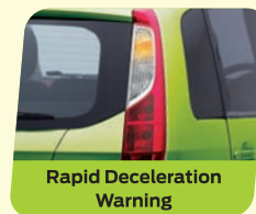
Rapid Deceleration Warning