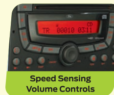
Speed Sensing Volume Controls