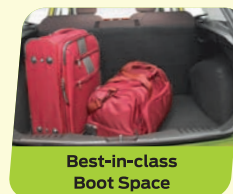
Best-in-class Boot Space