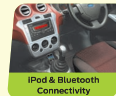
iPod & Bluetooth Connectivity