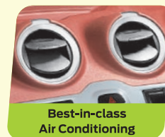
Best-in-class Air Conditioning