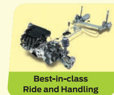
Best-in-class Ride and Handling