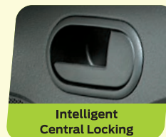
Intelligent Central Locking