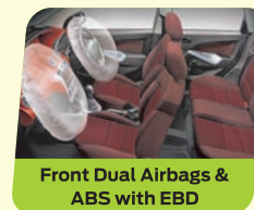
Front Dual Airbags & ABS with EBD