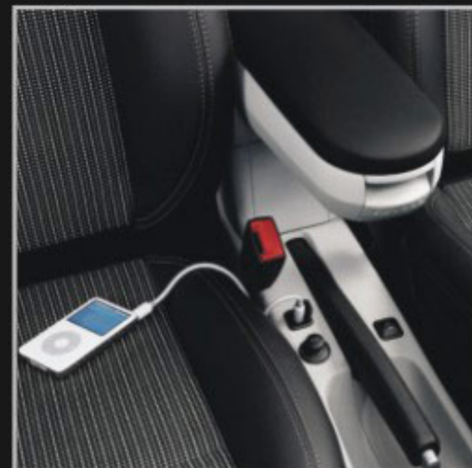
Auxiliary audio input gives you the freedom to use your Walkman, CD/MP3 player or iPod via a 3.5mm adapter