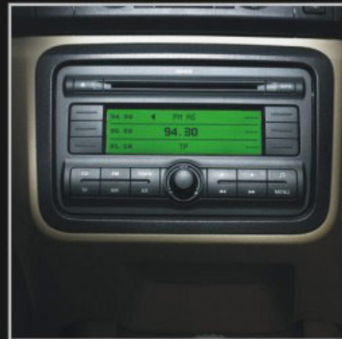
CD / MP3 player with large graphic display and 4 powerful speakers

Keeping you entertained comes naturally to us. So among other incredible reasons that keep the new Škoda Fabia on the road are also features that go beyond just driving.