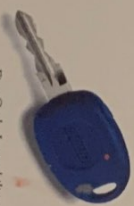
Fiat Code Immobiliser, the electronic engine locking key. (Optional)

Finally, all versions are fitted with Fiat's own Fire Prevention System (FPS). A state-of-the-art approach that reduces the risk of fire in a collision with the help of an inertia switch and a double valve to block the fuel flow.