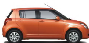
Metallic Sunlight Copper