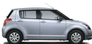
Metallic Silky Silver