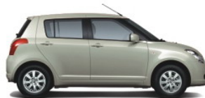
Pearl Metallic Arctic White