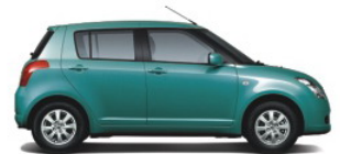
Metallic Ozone Blue