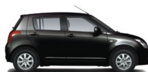
Metallic Midnight Black