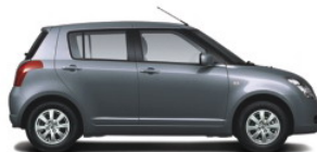
Metallic Azure Grey