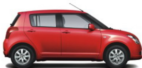
Solid Bright Red

Colours shown may vary from actual body colours due to printing on paper