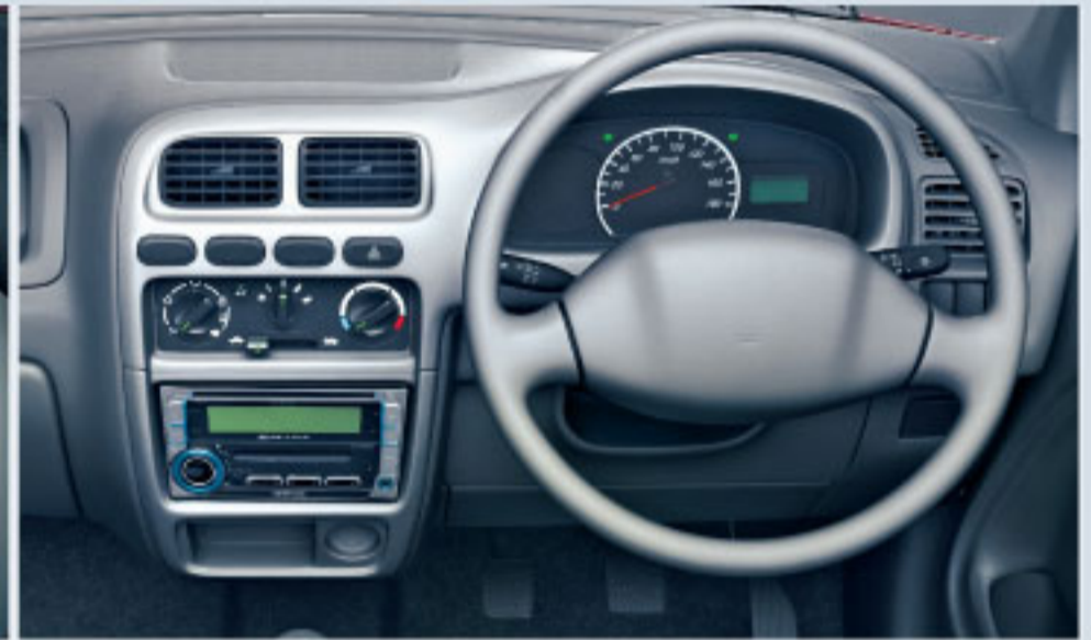
Dual Tone Dashboard