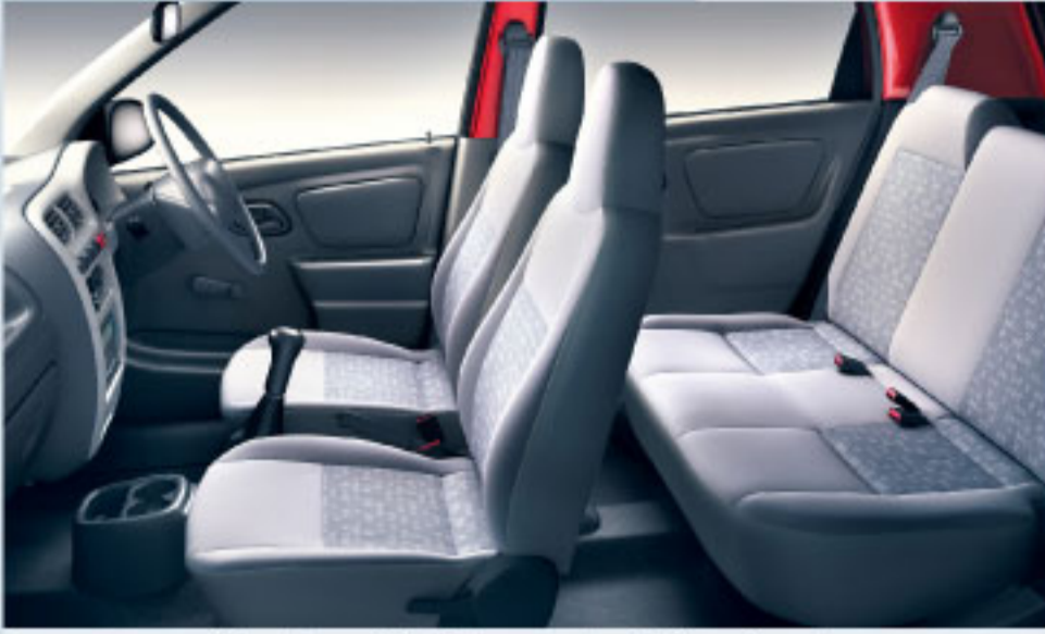
Seats with Integrated Headrest