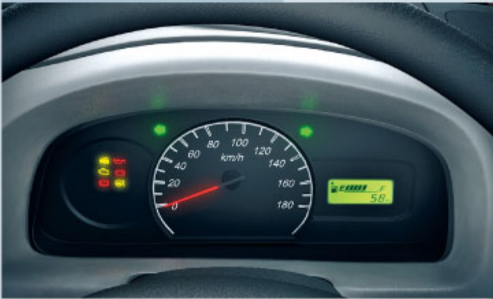
All new Speedometer with Digital Fuel Indicator