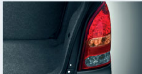
Sparkling tail lamps