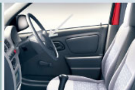
Collapsible steering column for avoiding injury to driver