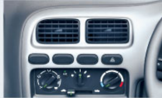
Multi-flow cooling A.C. (A.C. with heater)