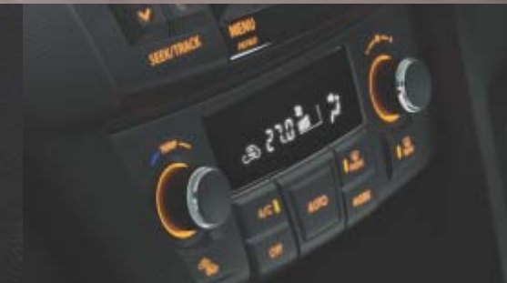
AUTOMATIC CLIMATE CONTROL