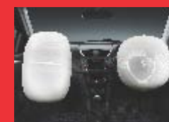
DUAL SRS AIR BAGS