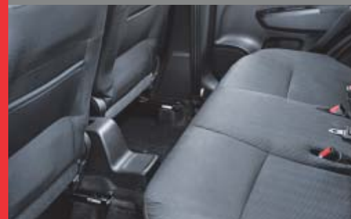
20mm INCREASED REAR LEGROOM 28mm INCREASED FOOT SPACE