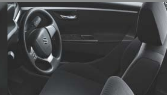
TILT STEERING AND DRIVER SEAT HEIGHT ADJUSTMENT