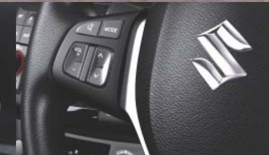
STEERING MOUNTED ILLUMINATED AUDIO CONTROLS