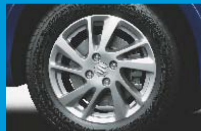
15" SIGNATURE ALLOYS