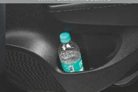
EASY-TO-USE STORAGE POCKETS