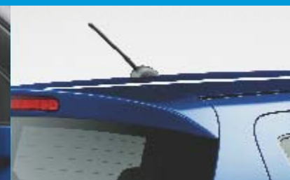
REAR SPORTY ANTENNA