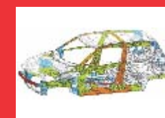
INCREASED TORSIONAL RIGIDITY