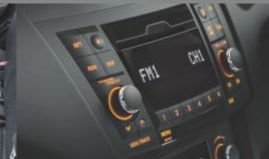
HIGH-END STEREO WITH 6 SPEAKERS, AUXILIARY INPUT AND USB SOCKET