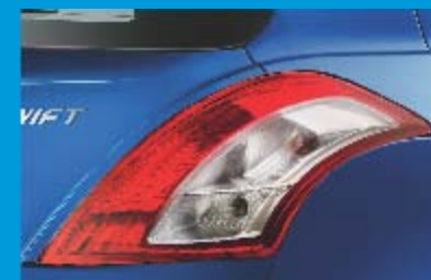
STYLISH VERTICAL TAIL LAMP