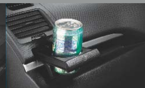
RETRACTABLE CUP HOLDER