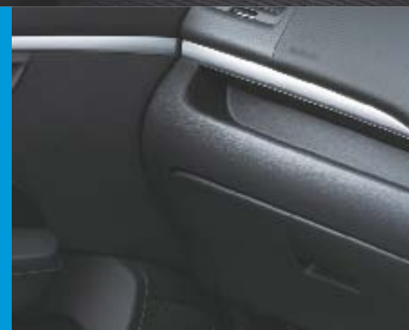
WRAP-AROUND SILVER ACCENT