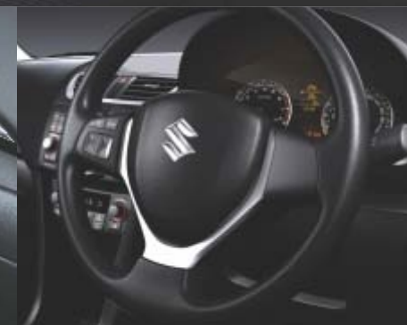
SPORTY THREE SPOKE STEERING WHEEL WITH SILVER ACCENTS