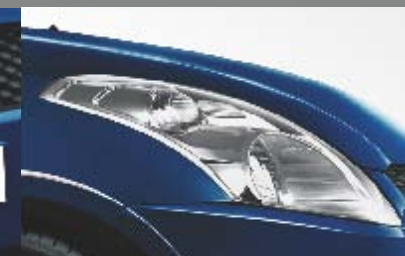
UNIQUE VERTICAL HEADLAMP