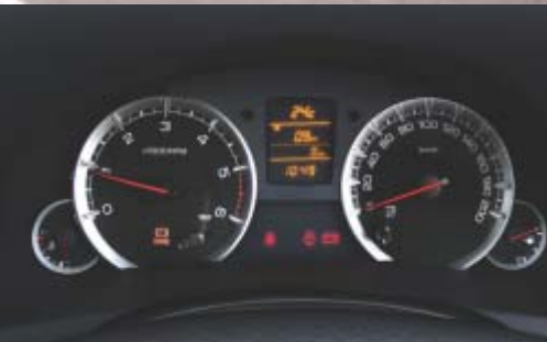
INSTRUMENT PANEL WITH MULTI-INFORMATION DISPLAY