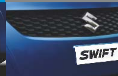
NEW DYNAMIC GRILLE