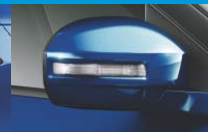
ORVM – TURN INDICATORS