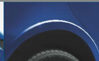
STRONG FENDER FLARE