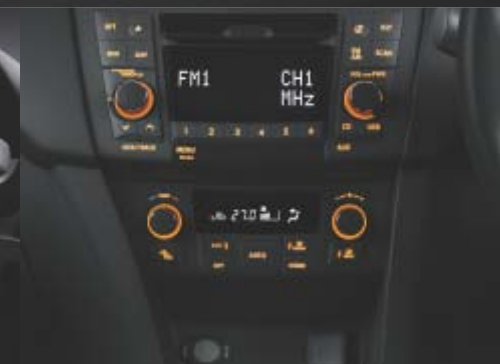
WATERFALL CENTRE CONSOLE