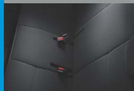
PREMIUM SPORTY FABRIC