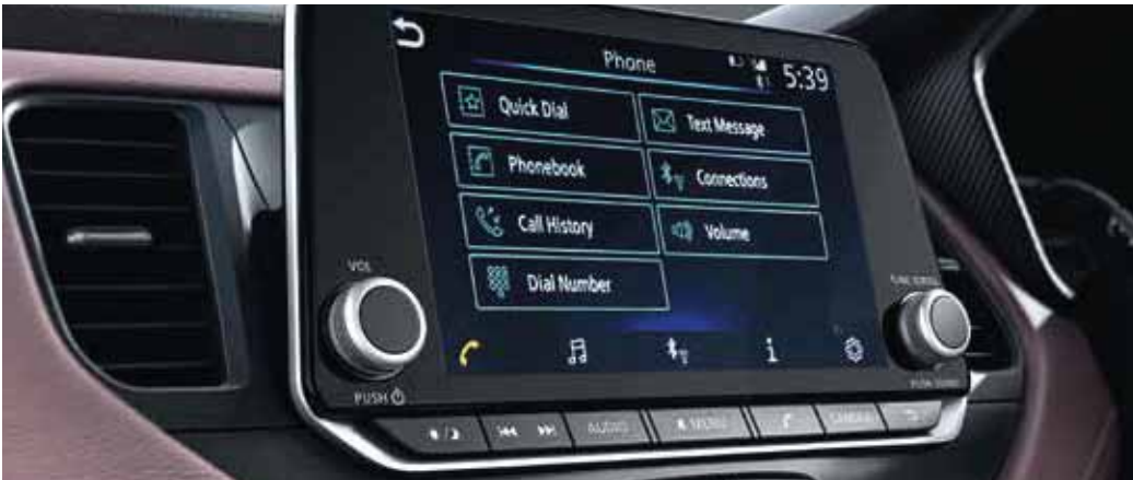
FLOATING 8.0 A-IVI WITH APPLE CARPLAY / ANDROID AUTO CONNECTIVITY AND VOICE RECOGNITION