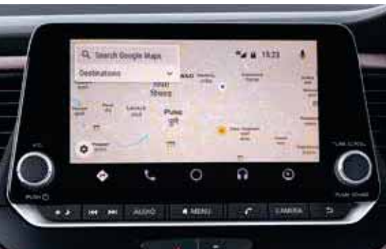
NAVIGATION THROUGH PHONE MIRRORING