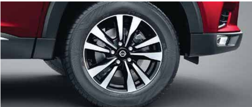
R17 5-SPOKE MACHINED ALLOY WHEELS