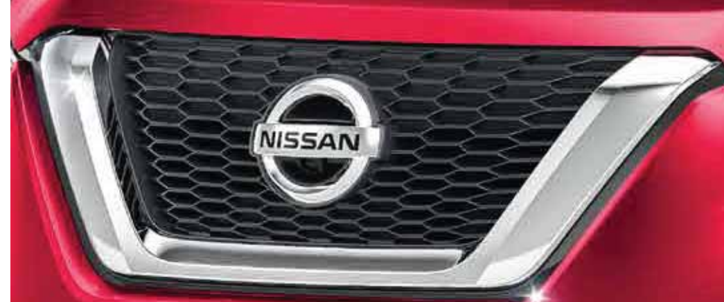
NISSAN SIGNATURE V-MOTION GRILLE