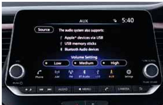
AUX / USB CONNECTIVITY