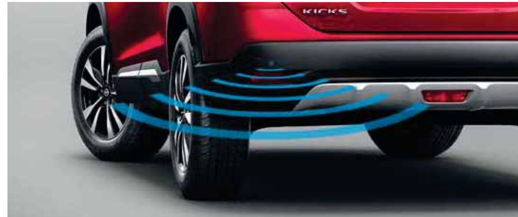
REAR PARKING SENSOR