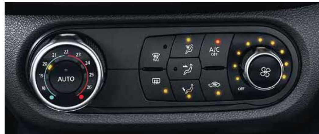
AUTOMATIC CLIMATE CONTROL (STANDARD)