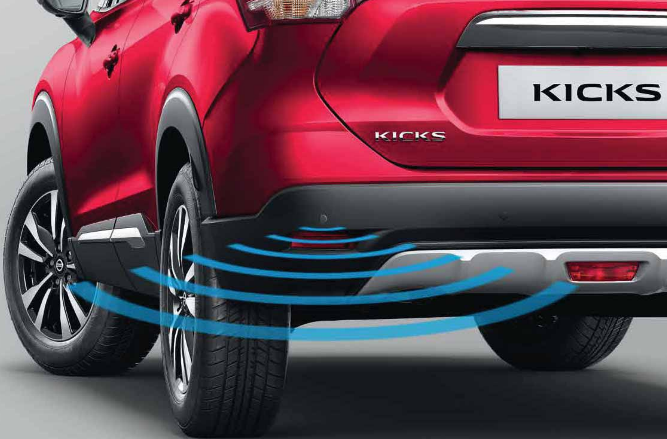
REAR PARKING SENSOR