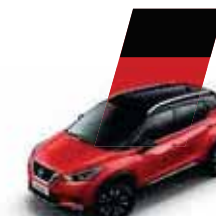
Fire Red & Onyx Black