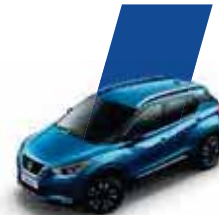
Deep Blue Pearl