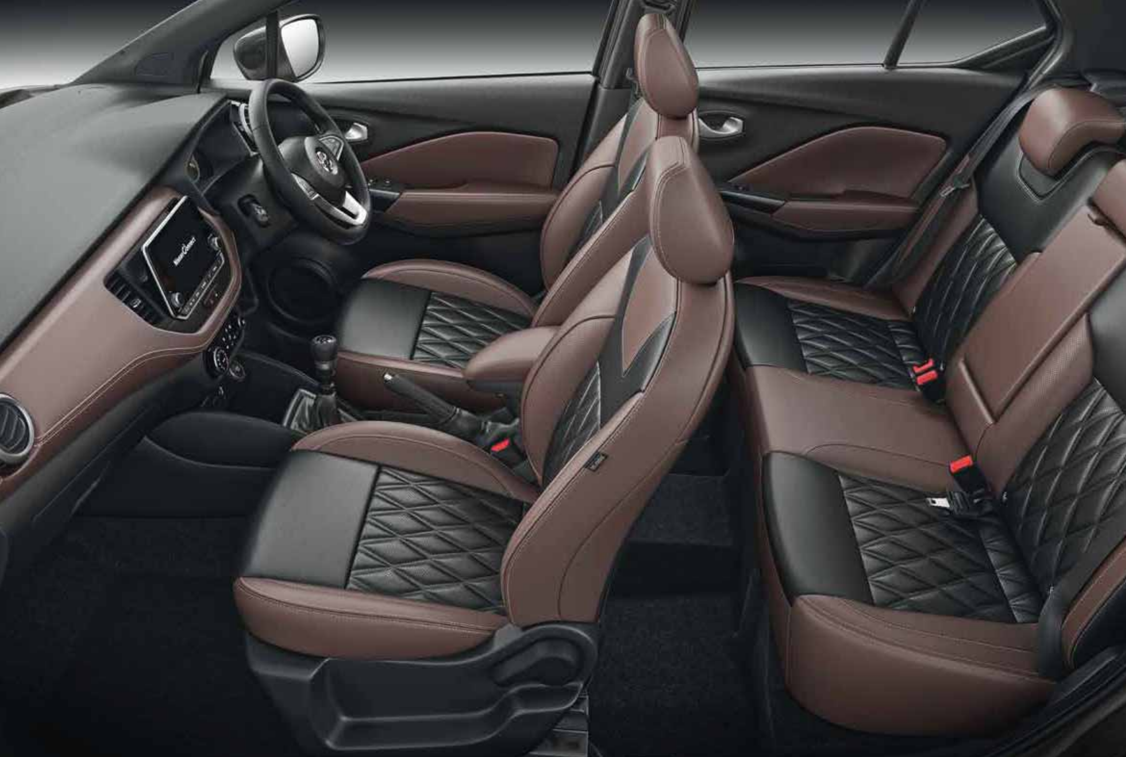
LUXURIOUS DUAL-TONE BLACK & BROWN INTERIOR THEME WITH CARBON FIBRE FINISH