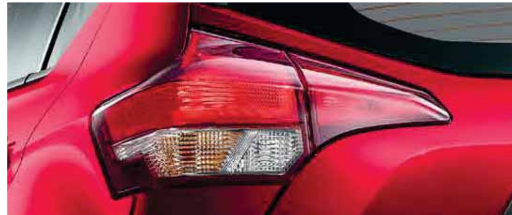
ICONIC BOOMERANG TAIL LAMPS