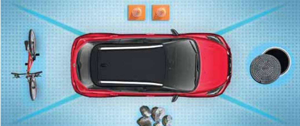
FIRST-IN-CLASS AROUND VIEW MONITOR