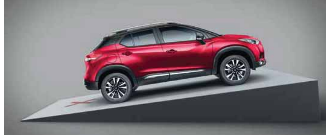
HILL START ASSIST