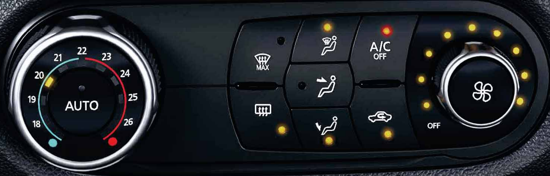
AUTOMATIC CLIMATE CONTROL (STANDARD)