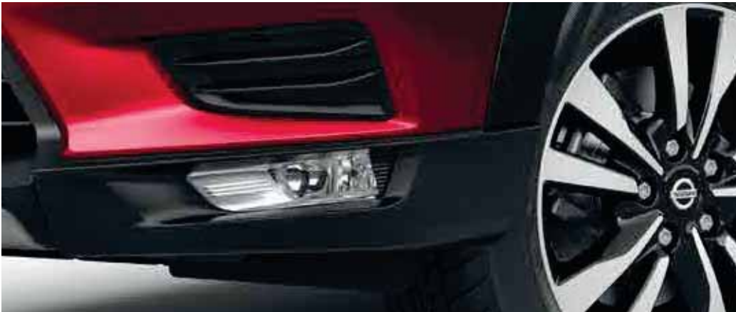
FRONT FOG LAMPS