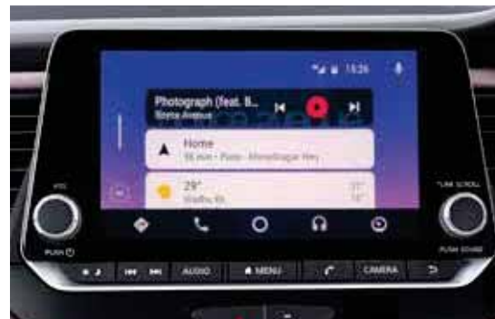
VOICE RECOGNITION (SIRI & OK GOOGLE ASSISTANT)