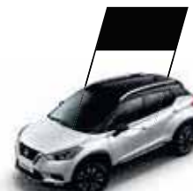
Pearl White & Onyx Black