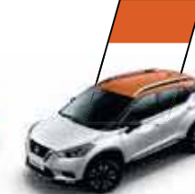
Pearl White & Amber Orange