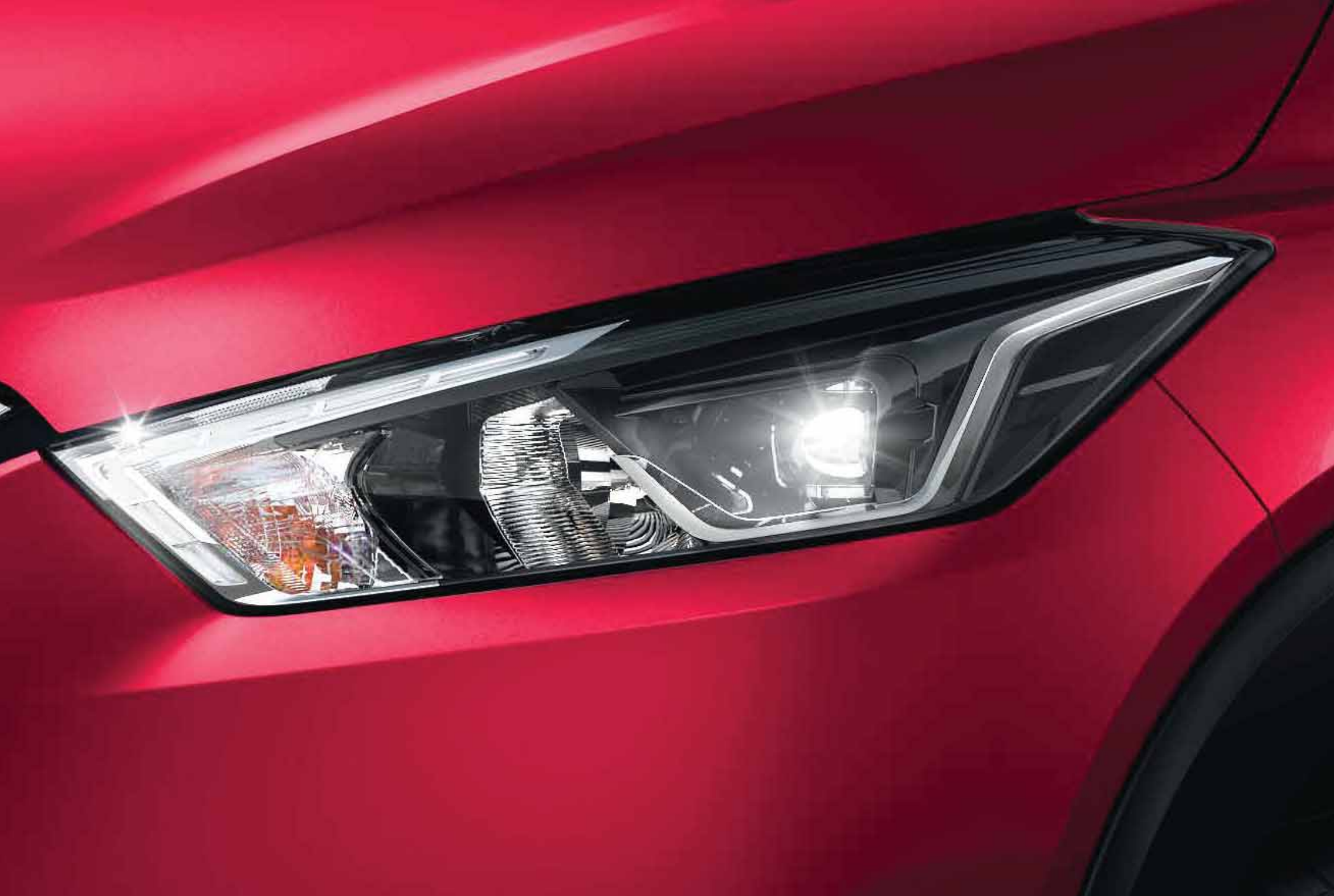
FIRST-IN-CLASS LED PROJECTOR HEADLAMPS (DUAL CHAMBER)