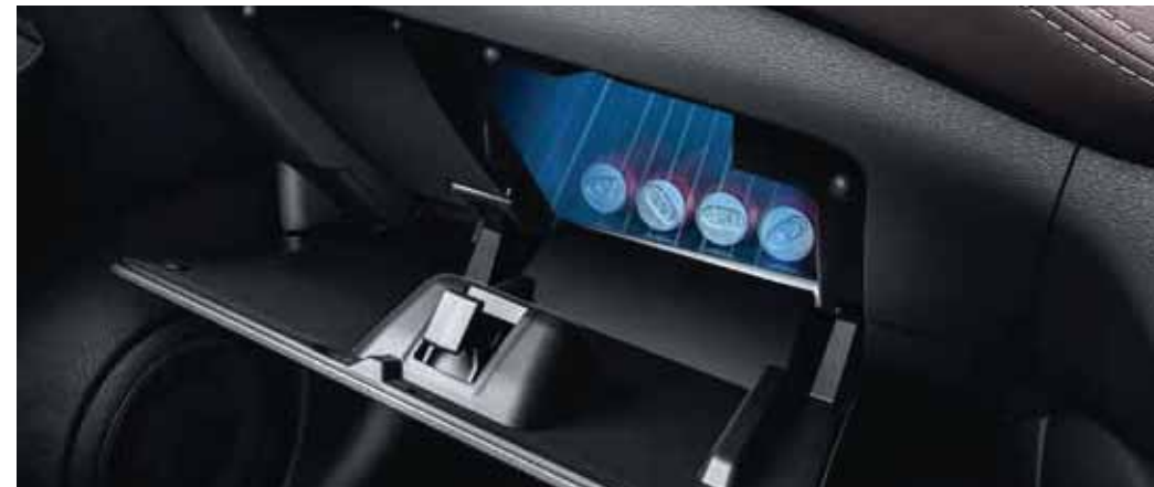
COOLING GLOVE BOX WITH ILLUMINATION