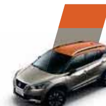
Bronze Grey & Amber Orange