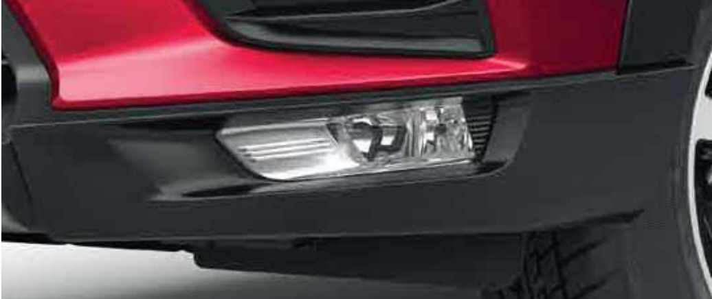
FRONT FOG LAMPS