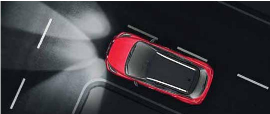
AUTO HEADLAMPS & FRONT FOG LAMPS WITH CORNERING FUNCTION