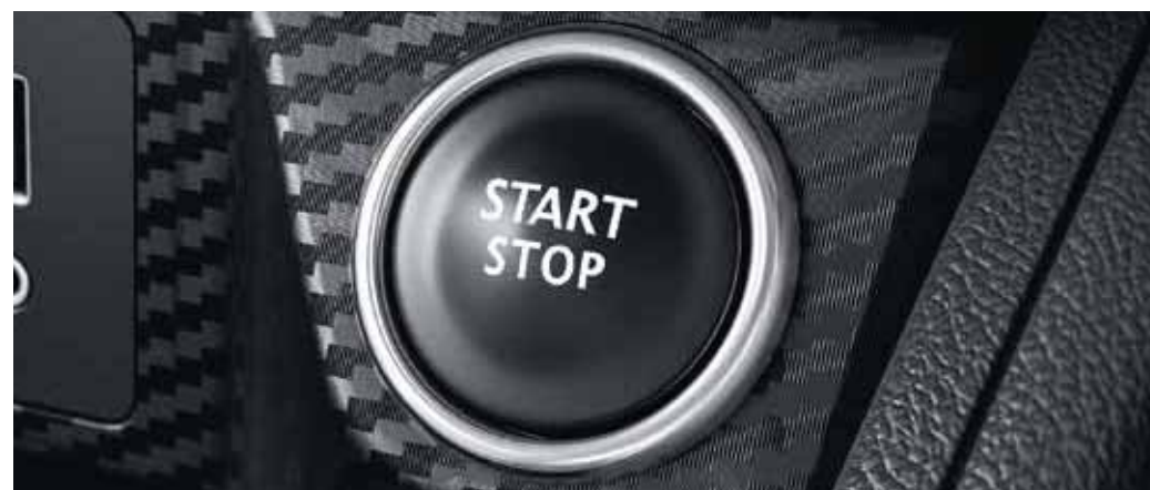
PUSH BUTTON START / STOP