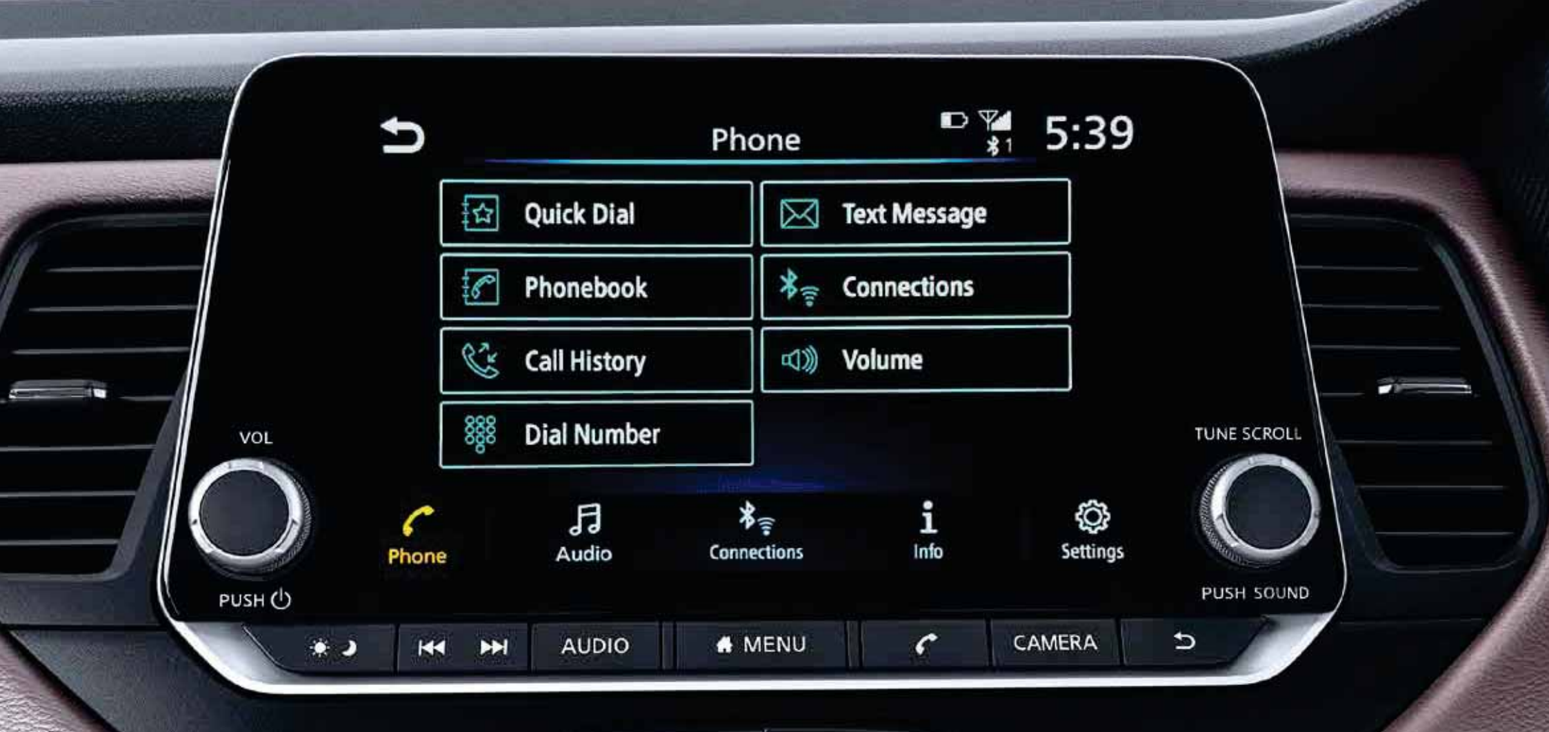
FLOATING 8.0 A-IVI WITH APPLE CARPLAY / ANDROID AUTO CONNECTIVITY AND VOICE RECOGNITION