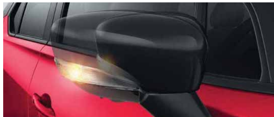
ELECTRICALLY ADJUSTABLE & FOLDING ORVMs WITH SHORT ARM