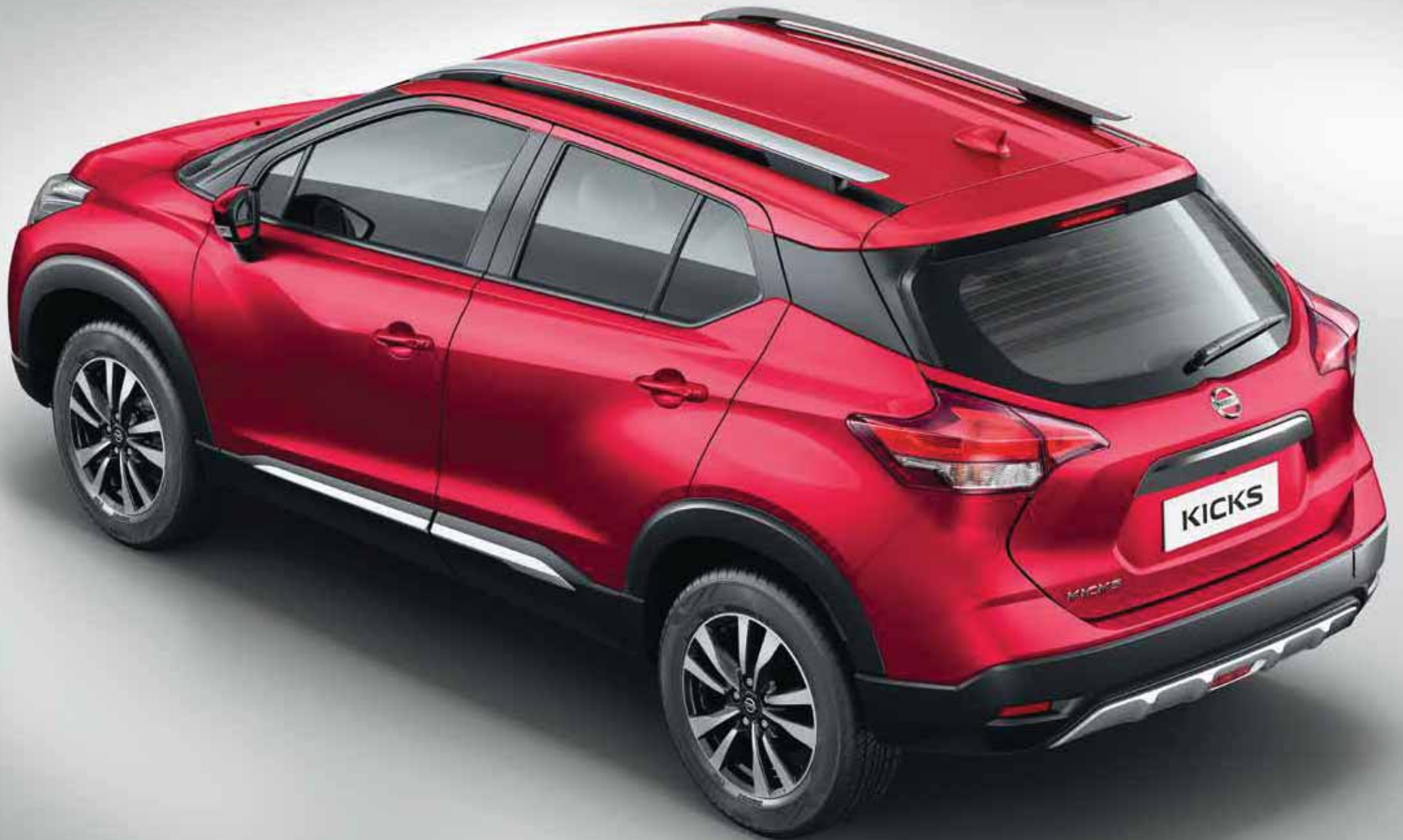
FUNCTIONAL ROOF RAIL