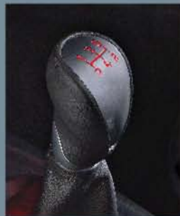
ILLUMINATED GEAR KNOB