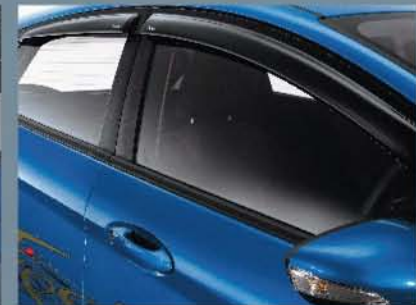
PREMIUM SLIMLINE WEATHERSHIELD