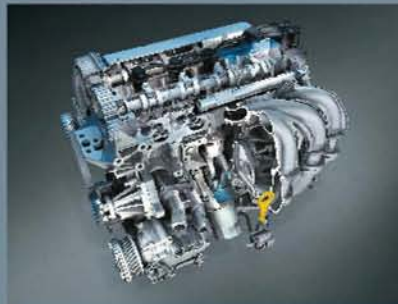
1.5l TIVCT AND 1.5l TDCi ENGINE

Available in both Manual and Automatic Transmission