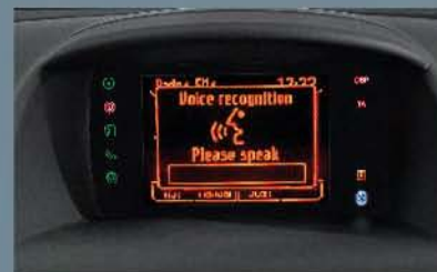
3.5 INCH HI-RESOLUTION LCD DISPLAY