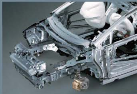
ULTRA HI-STRENGTH STEEL BODY

The All New Ford Fiesta's stylish body is reinforced with Boron Steel that is four times stronger and yet incredibly lighter. Safety is further reinforced by driver and passenger airbags. The standard Anti-lock Braking System with Electronic Brakeforce Distribution (ABS with EBD) gives you complete control, even upon sudden braking or unexpected swerving.