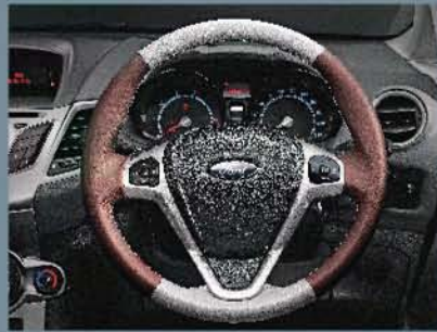
LEATHER STEERING WHEEL - PLUM RED (AUDIO CONTROLS)