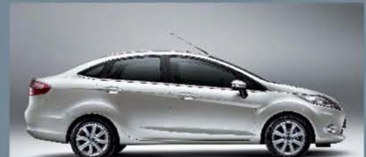
MOON DUST SILVER