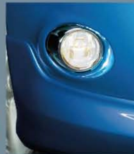
FRONT FOGLAMP KIT