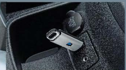
USB / AUX-IN CONNECTIVITY