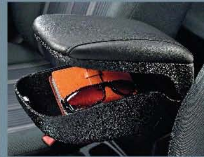
ARM REST WITH STOWAGE