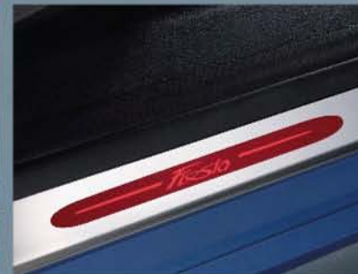
ILLUMINATED DOOR SCUFF PLATES