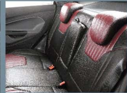
LEATHER VINYL SEAT COVERS

Interior personalisation pack available in Plum Red and Oceanic Blue.