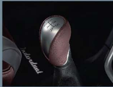
LEATHER GEAR KNOB