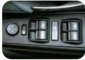
Power Windows with Delay & Auto Down Function