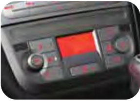
Powerful Automatic Air Conditioning