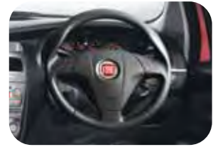
Leather Wrapped Steering Wheel