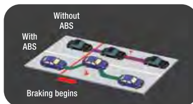
ABS with EBD