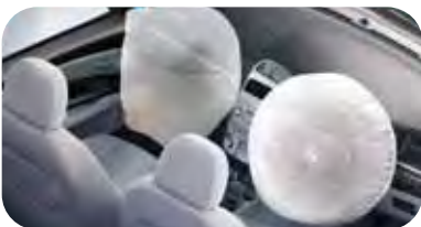
Dual Stage Front Airbags

Security Features: • Anti-theft engine immobiliser with rolling code – which prevents the engine from starting if the correct key isn't used; this is ensured by a constantly changing security code in the key • Remote keyless entry • Digital door open indicator with specific door notification • Double crank prevention system