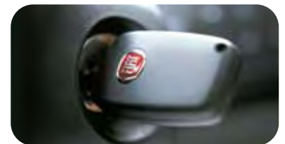
Anti-theft Engine Immobiliser with Rolling Code