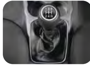
Leather Wrapped Gear Shift Knob