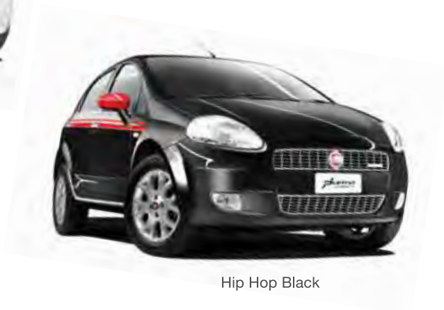
Hip Hop Black