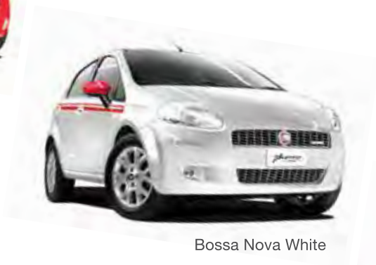
Bossa Nova White