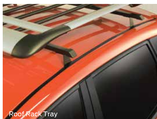
Roof Rack Tray