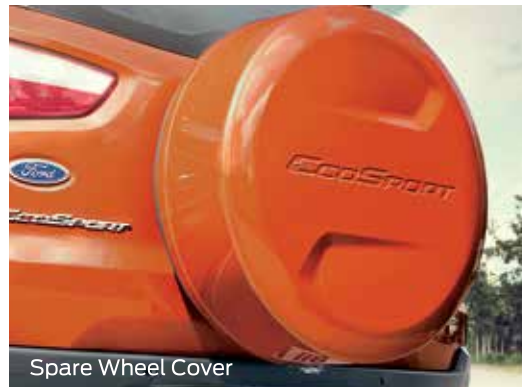
Spare Wheel Cover