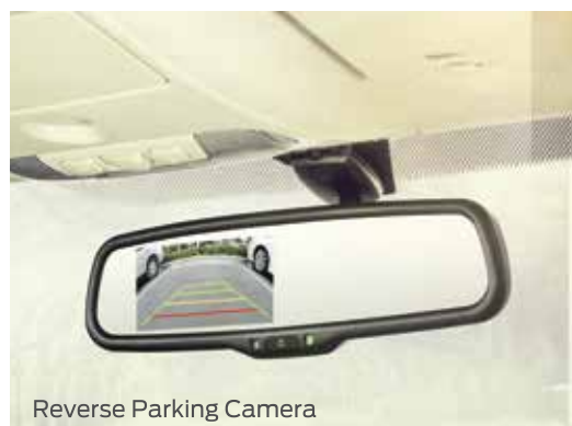
Reverse Parking Camera