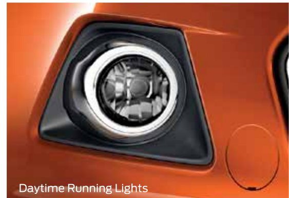
Daytime Running Lights