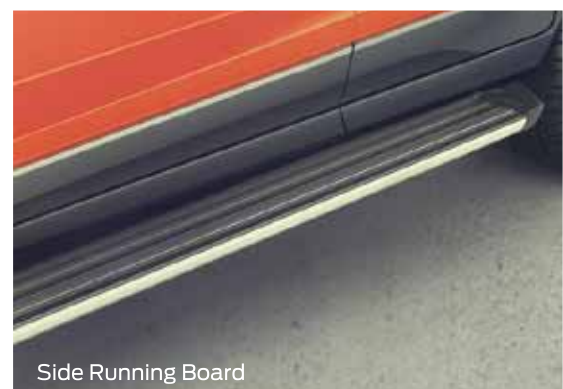
Side Running Board