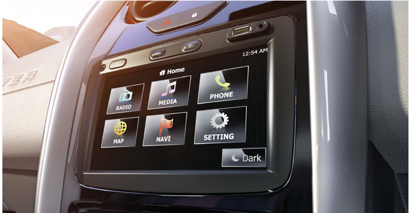
Touchscreen infotainment system

The first-in-class MediaNAV ensures an entertaining and relaxed drive. The touchscreen infotainment display features radio, USB and Aux-in connectivity and GPS navigation as well. The MediaNAV also eases your driving experience by enabling hands-free calling. Now wherever you go, stay connected.