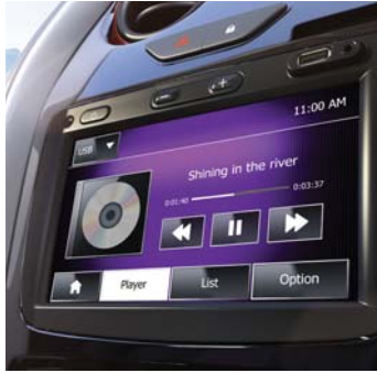
Dynamic multimedia player