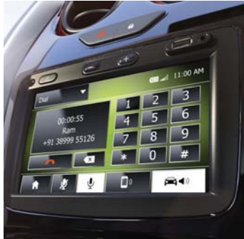
Phone control via Bluetooth®