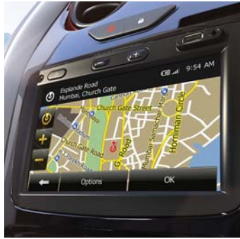
GPS satellite navigation