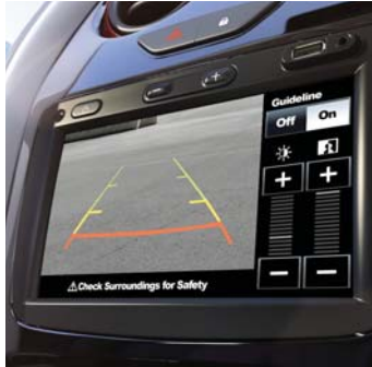
Reverse parking camera with guidelines