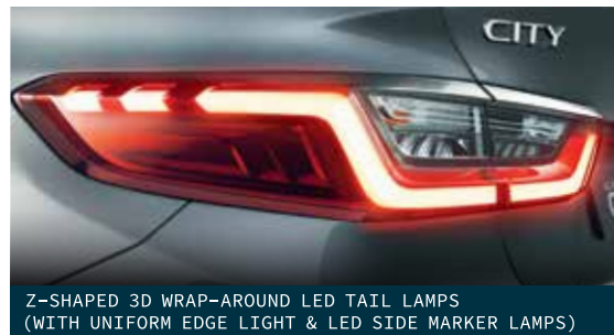
Z-SHAPED 3D WRAP-AROUND LED TAIL LAMPS (WITH UNIFORM EDGE LIGHT & LED SIDE MARKER LAMPS)