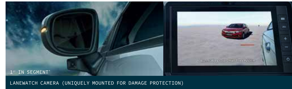
1 st IN SEGMENT* LANEWATCH CAMERA (UNIQUELY MOUNTED FOR DAMAGE PROTECTION)