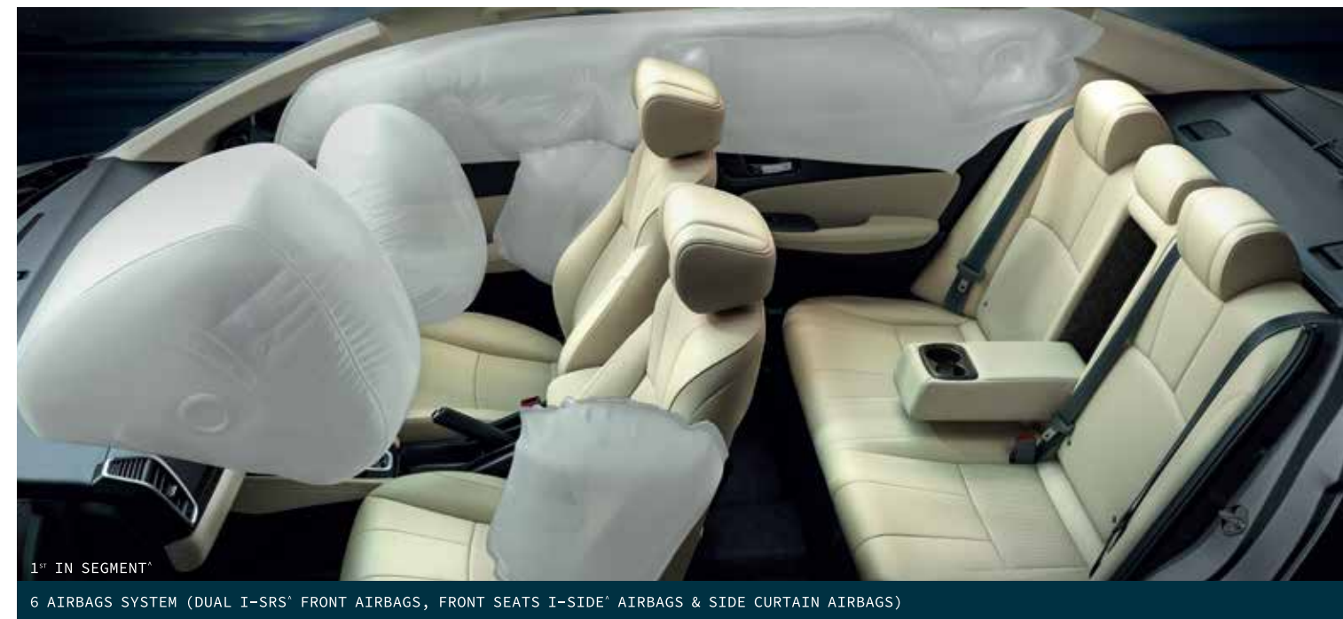
1 st IN SEGMENT* 6 AIRBAGS SYSTEM (DUAL I-SRS* FRONT AIRBAGS, FRONT SEATS I-SIDE* AIRBAGS & SIDE CURTAIN AIRBAGS)