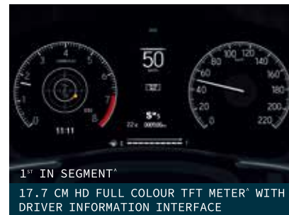
1 st IN SEGMENT* 17.7 CM HD FULL COLOUR TFT METER* WITH DRIVER INFORMATION INTERFACE