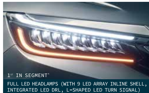
1 st IN SEGMENT* FULL LED HEADLAMPS (WITH 9 LED ARRAY INLINE SHELL, INTEGRATED LED DRL, L-SHAPED LED TURN SIGNAL)