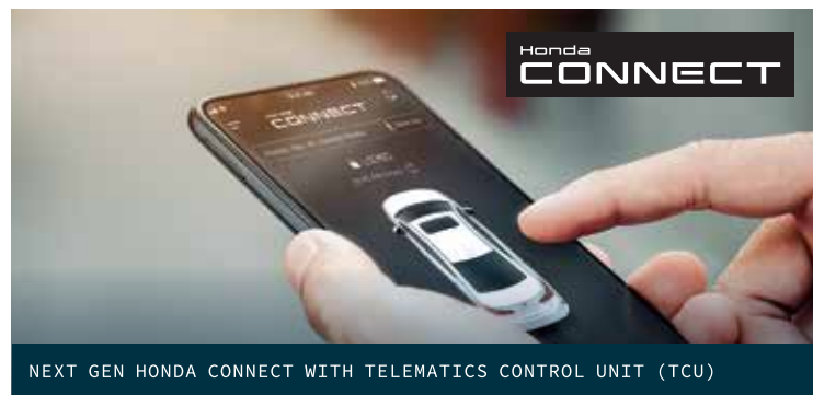
NEXT GEN HONDA CONNECT WITH TELEMATICS CONTROL UNIT (TCU)