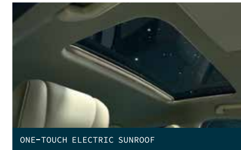
ONE-TOUCH ELECTRIC SUNROOF