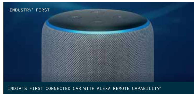
INDUSTRY* FIRST INDIA'S FIRST CONNECTED CAR WITH ALEXA REMOTE CAPABILITY*