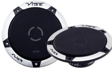
Coaxial Speaker (6")