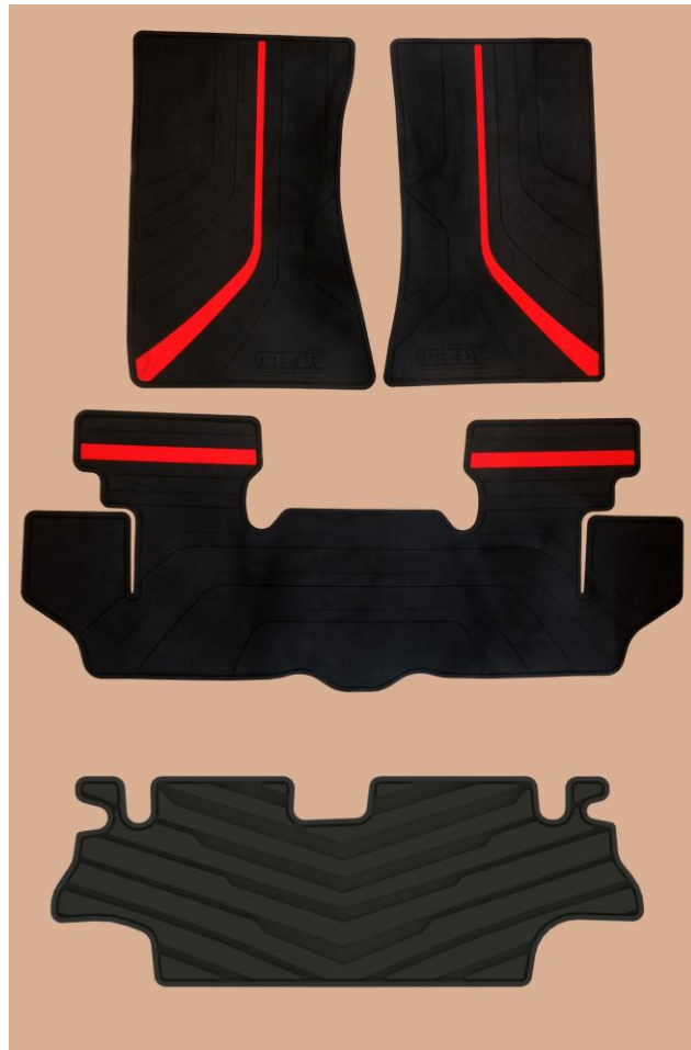
LX & AX (OPT) - Mat