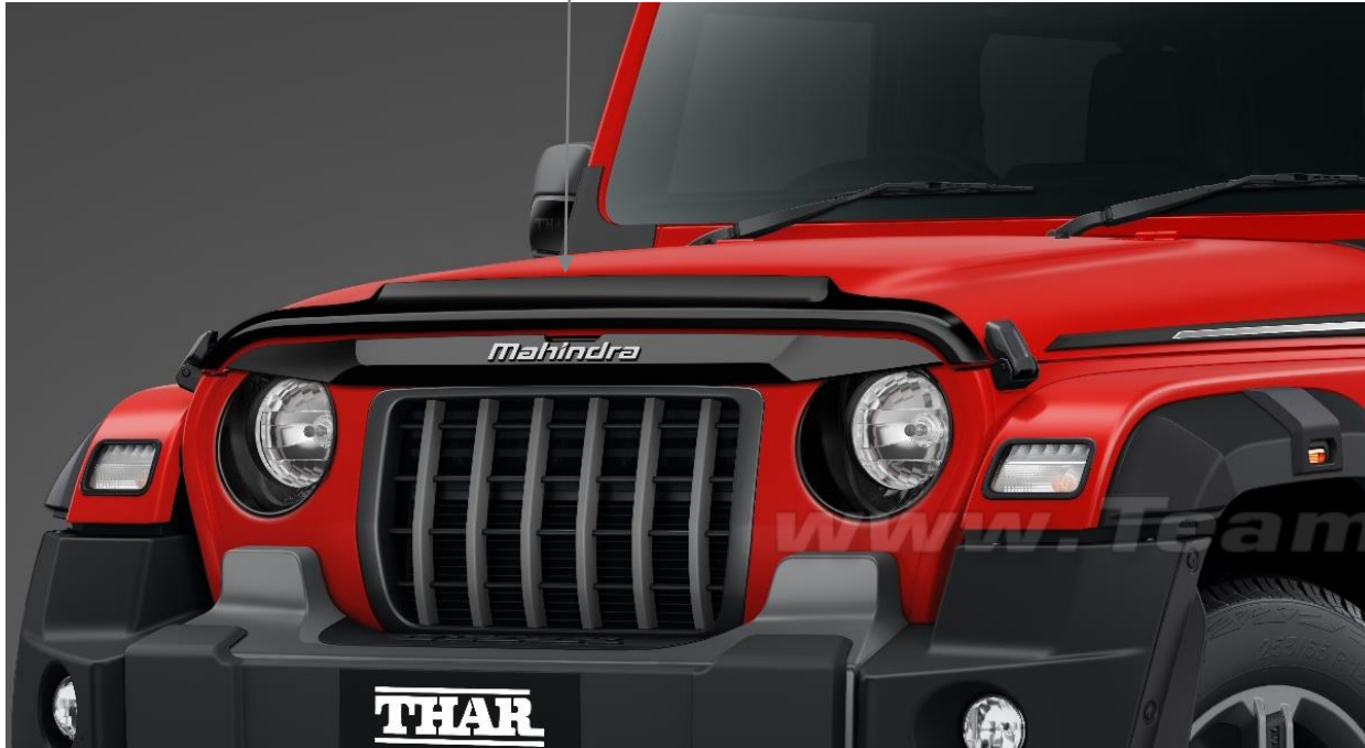
Front Bug Deflector