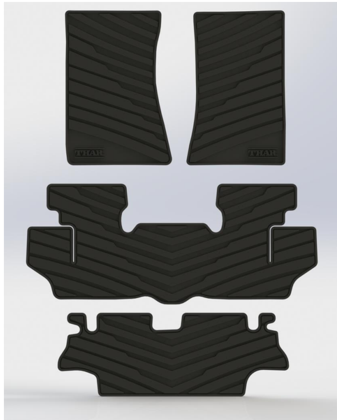
LX & AX (OPT) - Mat