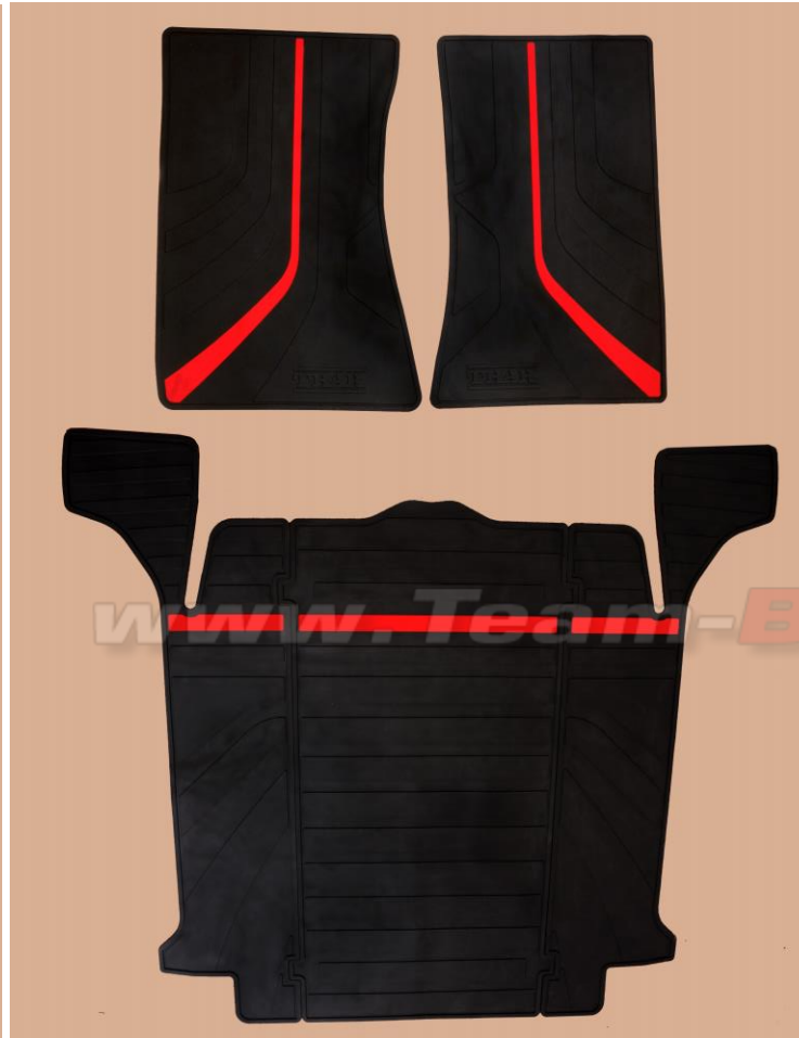
AX AC & AX (MTO) - Mat