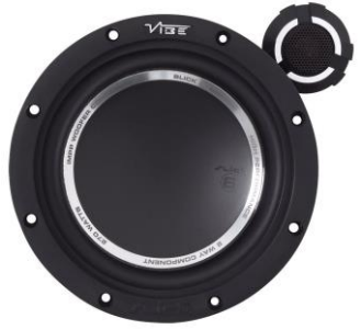
Component Speaker (6")