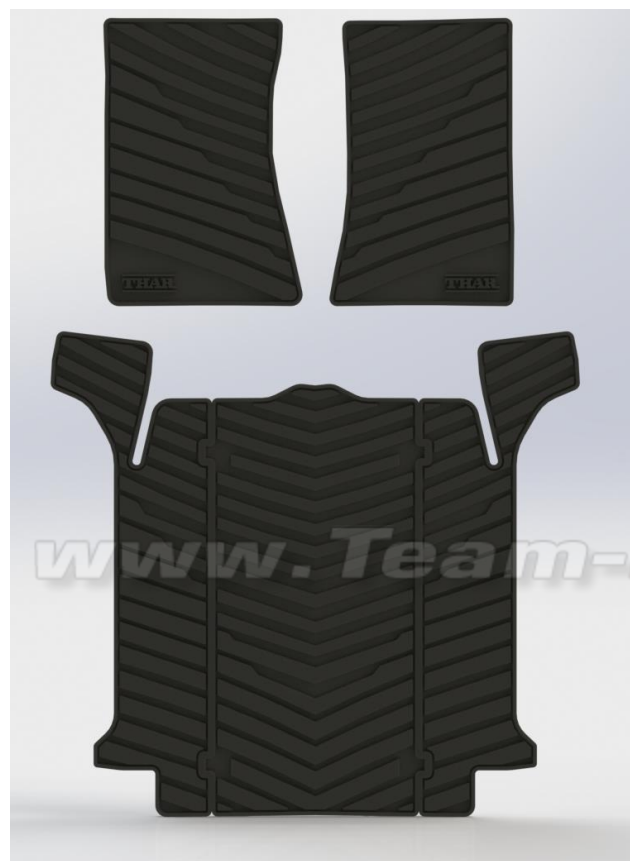
AX AC & AX (MTO) - Mat