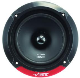
Component Speaker (5")