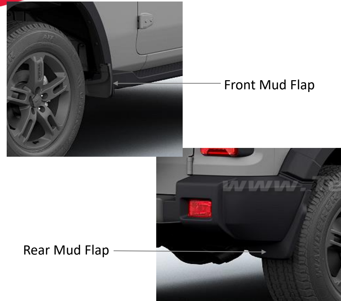
Front Mud Flap