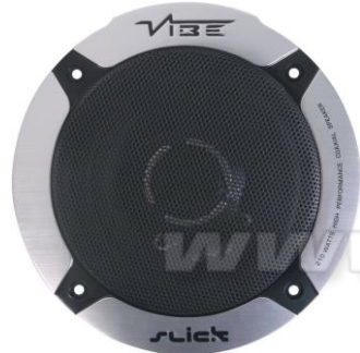
Coaxial Speaker (5")