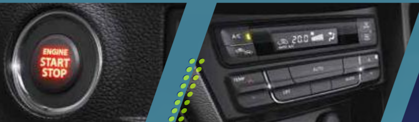
Smart entry with Engine Push Start/Stop Button [Standard across all variants]