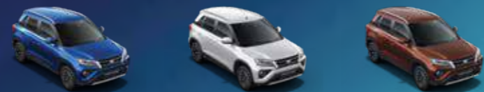
• SPUNKY BLUE • SUNNY WHITE • RUSTIC BROWN