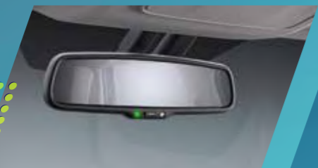
Electrochromic Rearview Mirror