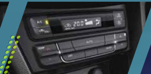
Auto AC [Standard across all variants]