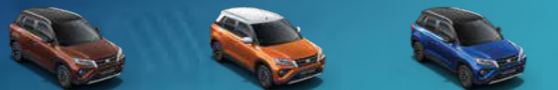
• RUSTIC BROWN WITH SIZZLING BLACK ROOF • GROOVY ORANGE WITH SUNNY WHITE ROOF • SPUNKY BLUE WITH SIZZLING BLACK ROOF

Disclaimer: * Application features & displays may vary depending on different Operating Systems or Smart-phone Devices used • Avoid using the phone while driving for your safety • Apple CarPlay is registered trademark of Apple Inc • Android Auto is registered trademark of Google Inc • Bluetooth is a registered trademark of Bluetooth SIG.