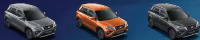
• SUAVE SILVER • GROOVY ORANGE • ICONIC GREY