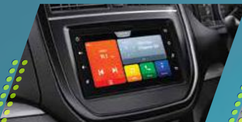
New Smart Playcast touchscreen audio with Android Auto/Apple Carplay and smartphone-based navigation*