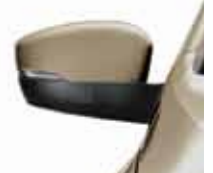
Electrically Foldable External Mirrors with Side Turn Indicator