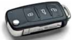
Engine Immobiliser with Floating Code System