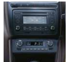
ŠKODA Audio Player, 2-DIN + Climatronic