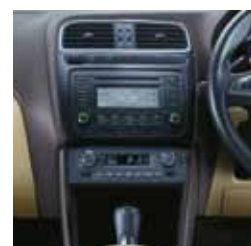
Chrome Interior Trim