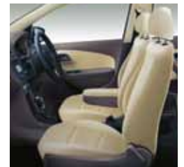
Leatherette Seats Upholstery*