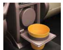
Cup Holders, Front and Rear

(-) Not Available (♦) Standard Equipment