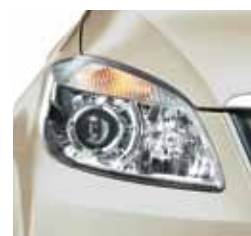
Halogen Projector Headlights