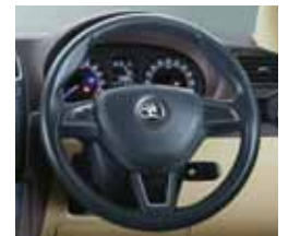
Leather Wrapped Multi-function Steering Wheel