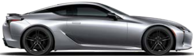
Sonic Silver <1J2>