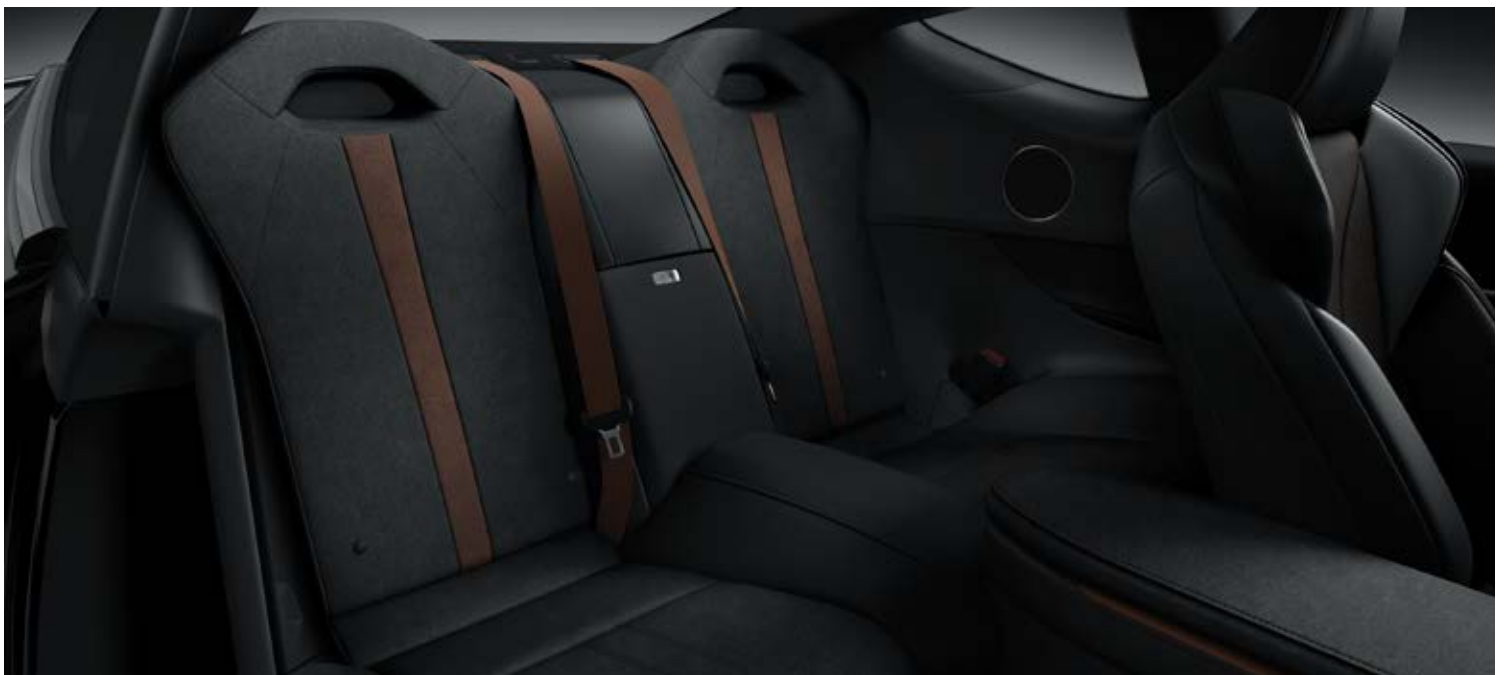
Black and saddle tan

Vehicles pictured and specifications detailed in this catalog may vary from models and equipment available in your area. Please inquire at your local dealer for details on the availability of features.