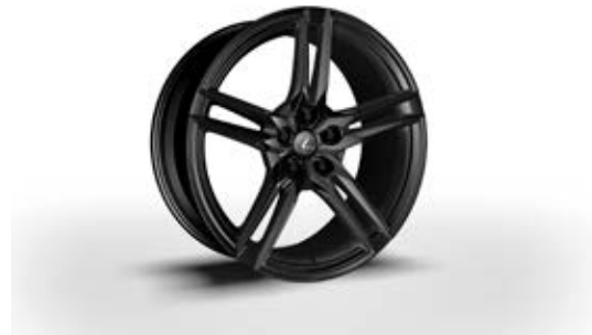
Exclusive 53.34 cm (21-inch) forged wheel