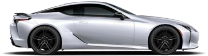
White Nova Glass Flake <083>