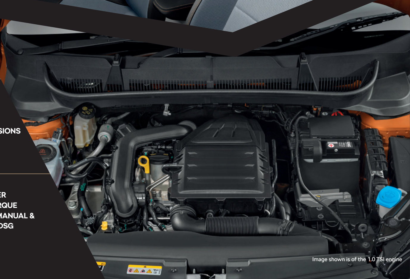
Image shown is of the 1.0 TSI engine