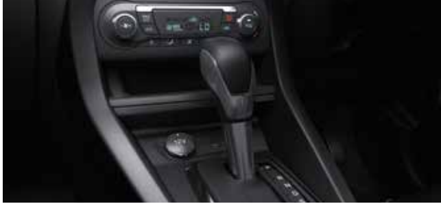
6-Speed Automatic Transmission