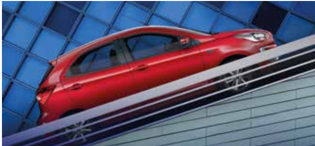
Hill Launch Assist