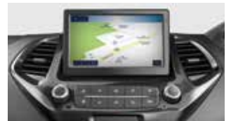
Touchscreen With Embedded Navigation