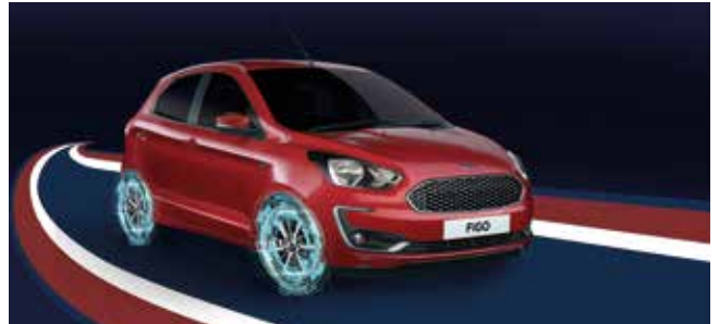
Electric Stability Control