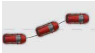
ABS & EBD