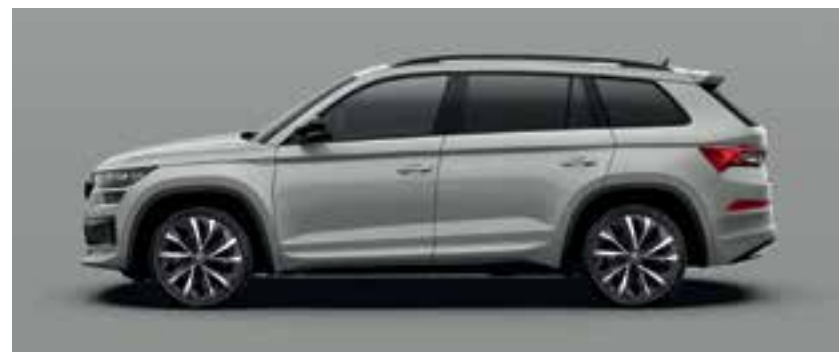
STEEL GREY METALLIC