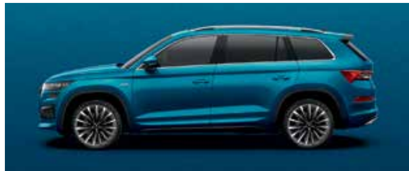
LAVA BLUE METALLIC