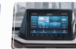
SmartPlay Pro+ with Surround Sense powered by ARKAMYS