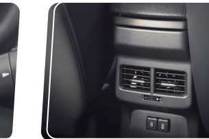
Rear AC Vents with Fast Charging USB Ports