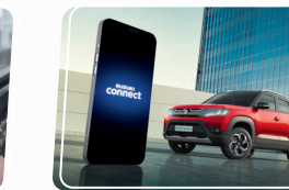
Next Gen Suzuki Connect