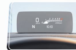
Head Up Display