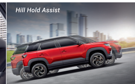
Hill Hold Assist

The Hot and Techy Brezza comes with a bundle of safety features that help keep the fun in your urban adventures intact. It is equipped with 20+ safety features including 6 airbags and ESP with Hill Hold Assist, ensuring that your safety is our priority.