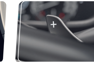
6-Speed AT with Paddle Shifters