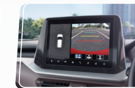
360 View Camera