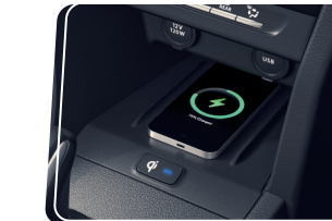
Wireless Charging Dock

The Hot and Techy Brezza carries a youthful and exciting appeal on the inside with your convenience at its core. It gets a unique design, modern and sleek look and black and brown interiors with silver accents for a sporty and urban feel. The City-Bred SUV also has Rear AC Vents, a Fast Charging USB Port (Type A and C) and a flat bottom Steering Wheel for your enhanced comfort and convenience. The 6-Speed Automatic Transmission with Paddle Shifters and Telescopic Steering ensure you go on city adventures comfortably.