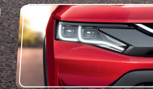
Dual LED Projector Headlamps with LED DRLs