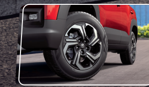
Bold Geometric Alloy Wheels