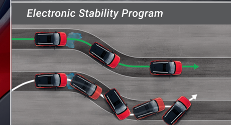
Electronic Stability Program